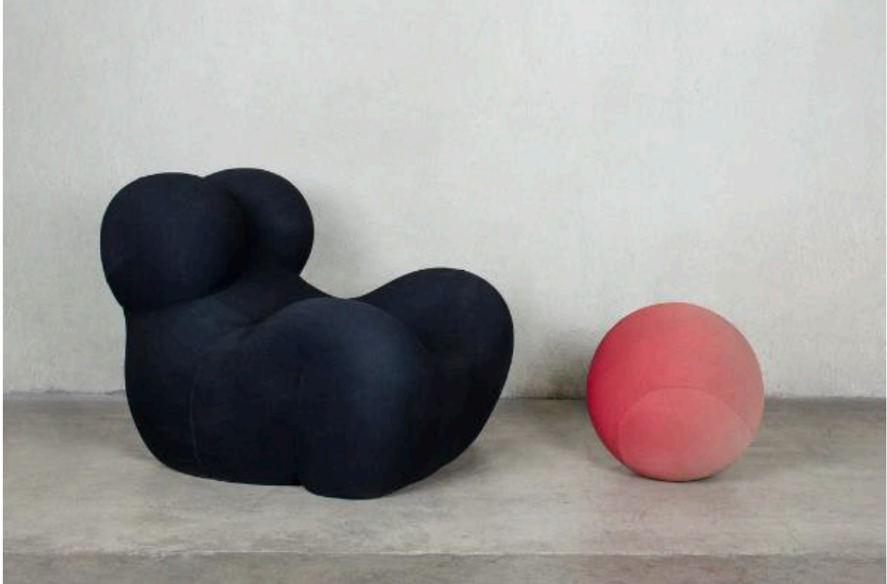
Mr. Pesce's Up5 armchair with Up6 pouf, of polyurethane foam structure and elastic fabric upholstery, for B&B, from Casa Carezza, 1969. It is at Friedman Benda.

He soon abandoned the exalted objects of High Modernism. In Chelsea, in a complementary show, specimens from his early experiments from the '60s through the '90s, are exhibited in "Gaetano Pesce: Age of Contaminations," a show at Friedman Benda (through Dec. 14). Unlike the objects in "Working Gallery," expressions of a fully developed aesthetic, this collection of 20 or so rarely assembled furnishings, some commissioned for private homes, show the trials he matured through to arrive at his performance on Fifth Avenue.