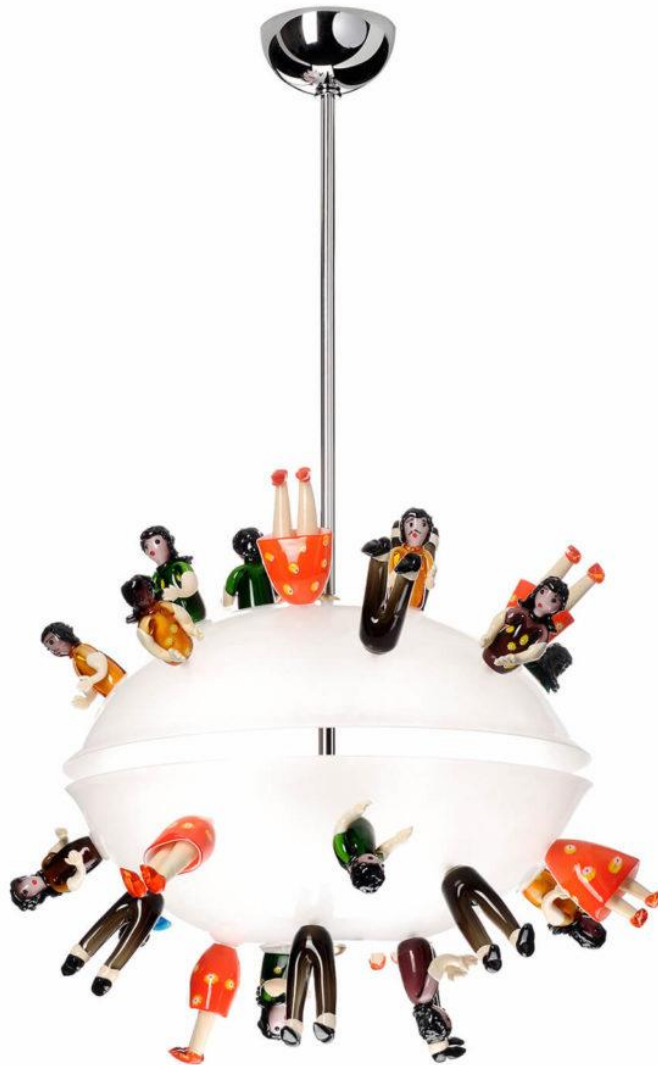
Campana Brothers, 'Esperança lamp', 2010

Portuguese. Being Brazilian is being a hybrid being. Even if we touch the Brazilian cliché, it is about doing it with subtlety, a certain elegance, and irony.