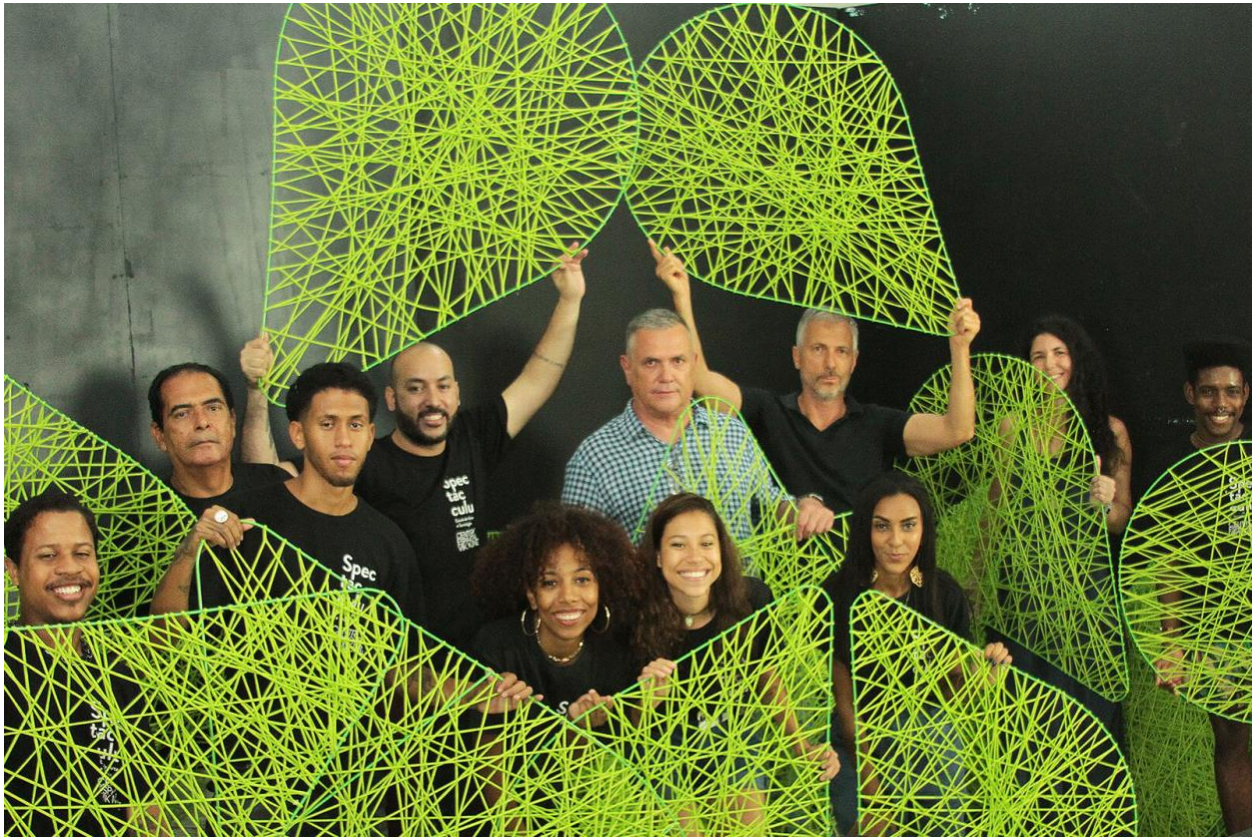
Campana Brothers and the Spetaculu team who helped with the exhibition installation