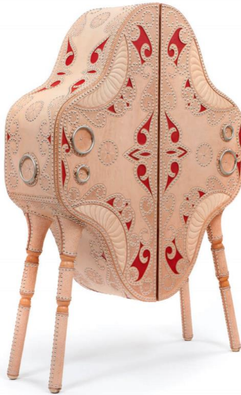
Campana Brothers, 'Cangaço' cabinet, 2015

TDE: Right at the entrance you will feature a wall screen made of Brazilian breeze blocks. What's the story of that piece?