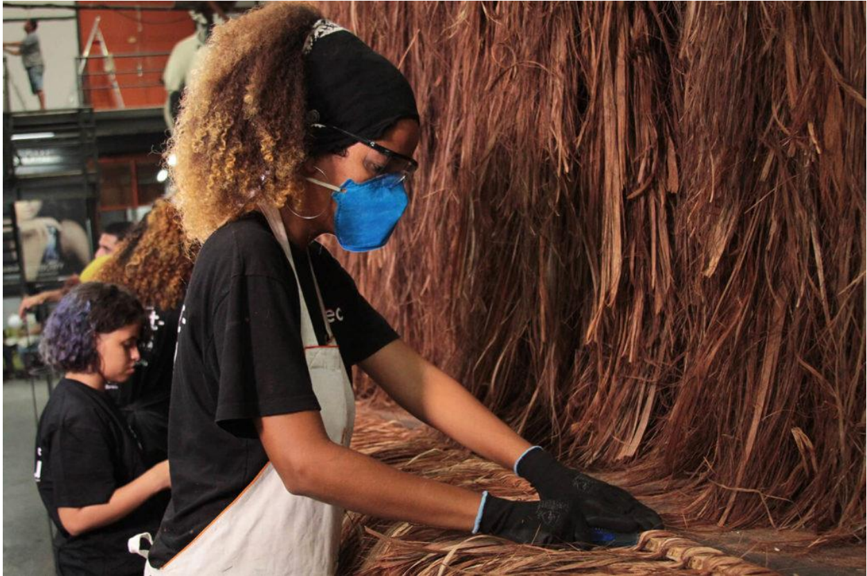
Spetaculu members working on a piassava column

British Museum! It is our cultural heritage! We want to draw attention to the need to protect and preserve that heritage.