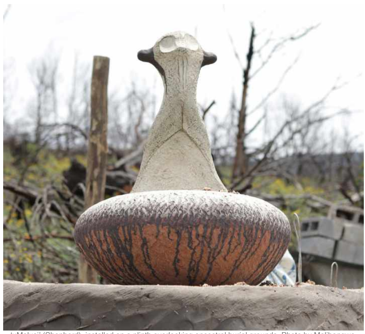
'uMalusi' (Shepherd), installed on a plinth overlooking ancestral burial grounds.