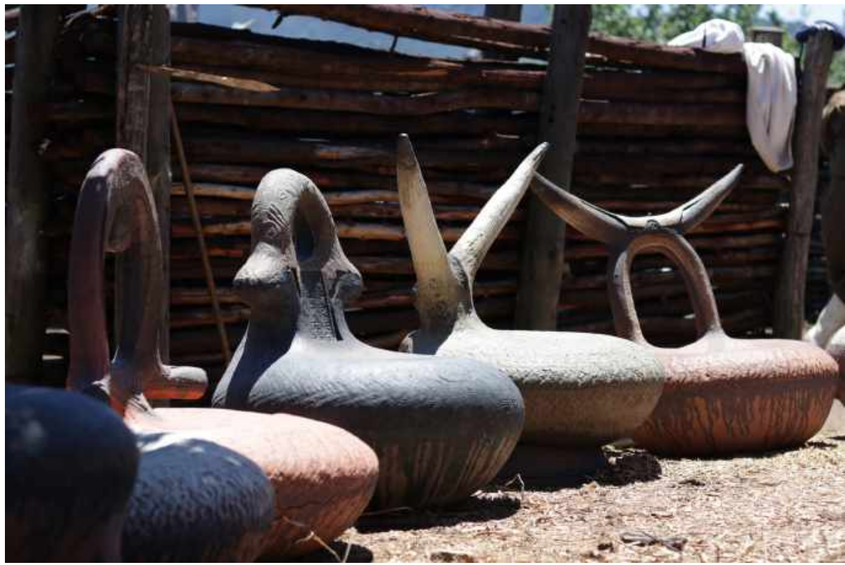
Left to right: 'uYalezo' (Messages), 'eNtshonalanga' (Sunset), 'uMnga' (Acacia Tree), 'iNkomo' (Cattle).