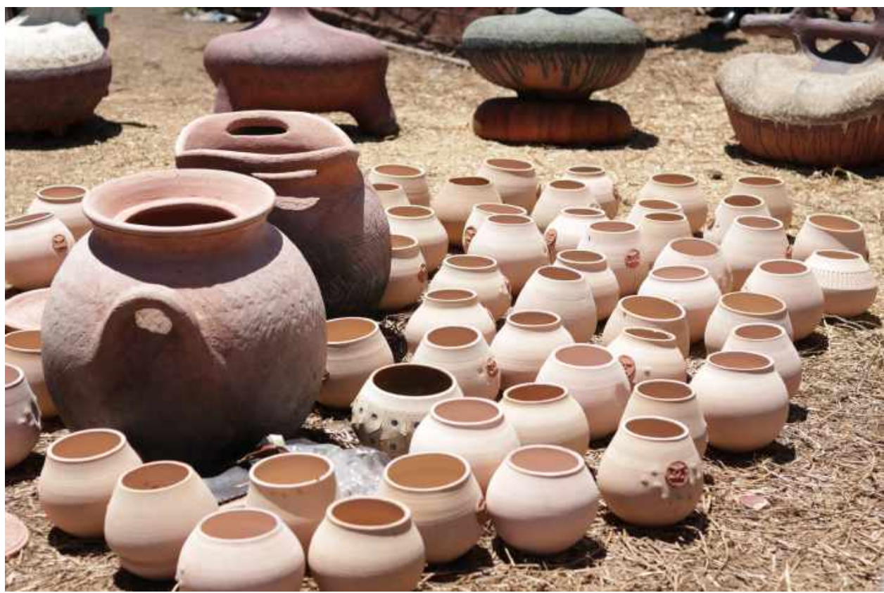
Dyalvane made pots for each of the households in the village.