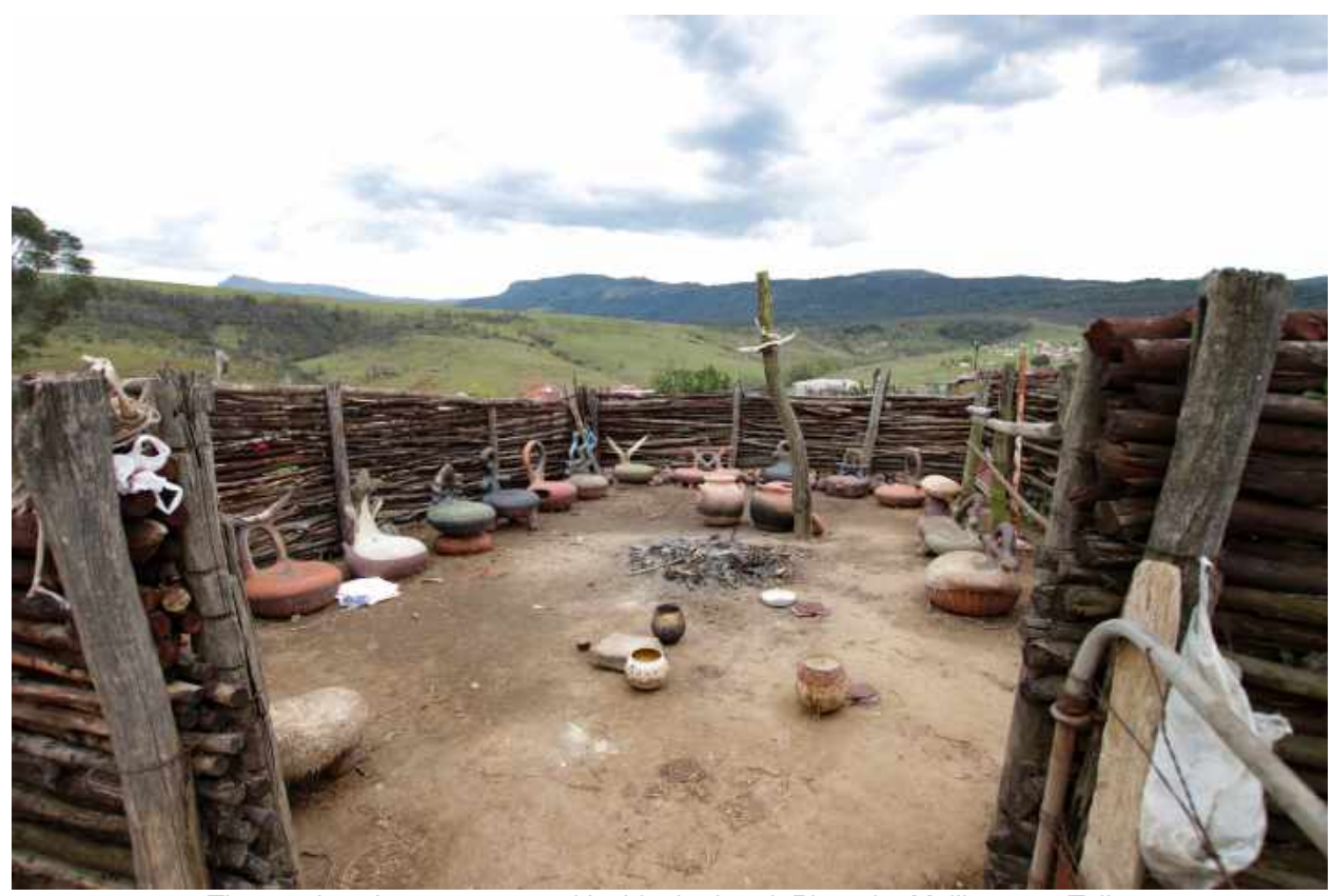
The stool sculptures arranged inside the kraal.