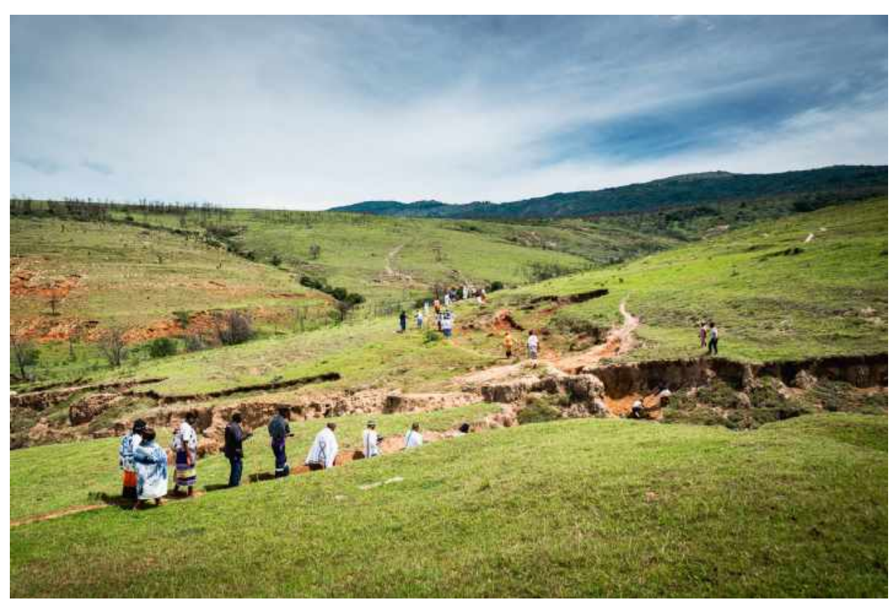
Andile Dyalvane and family carry the sculpture title 'uMalusi' (Shepherd), to the site of the old village that was forcibly removed, where is was installed to overlook Dyalvane's ancestors graves.