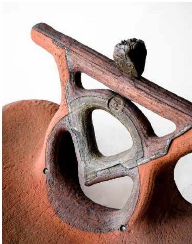
uMama (mother) detail