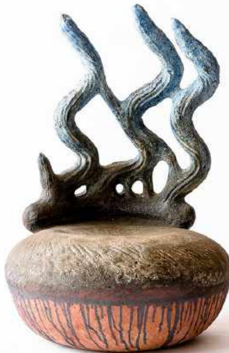
iMpepho (clary sage)