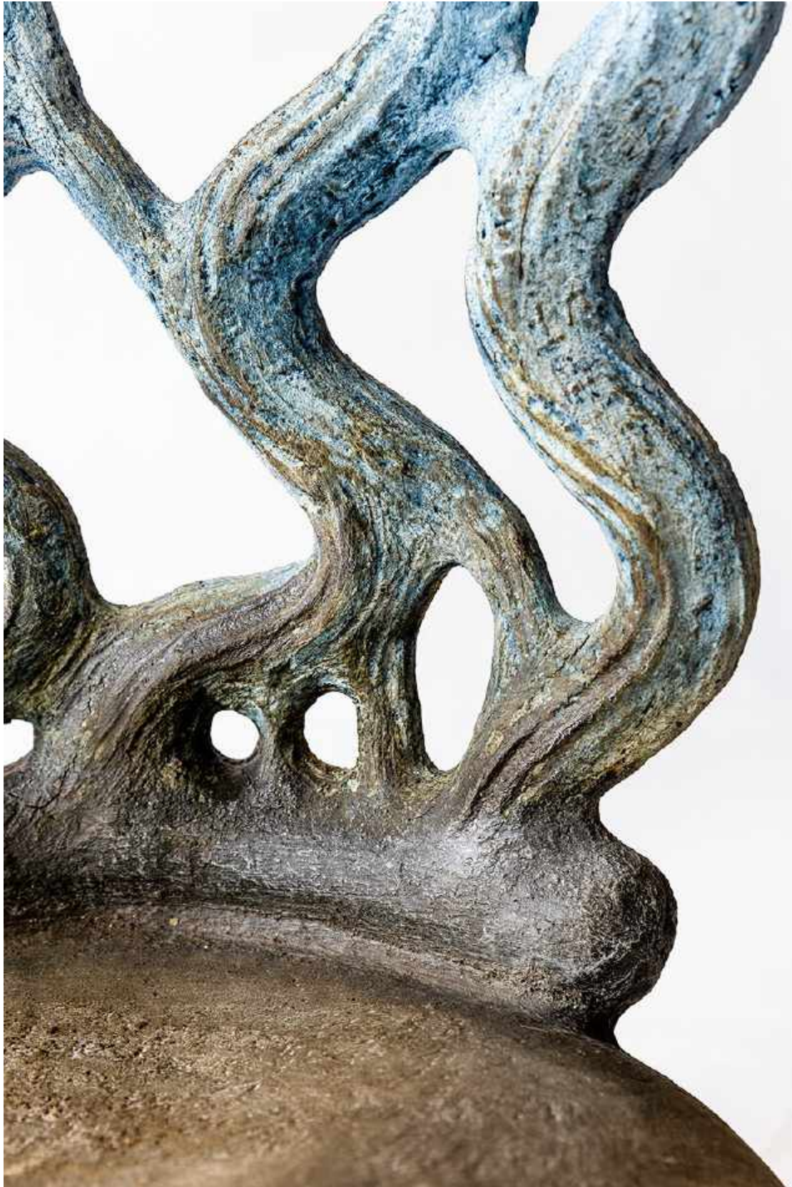
iMpepho (clary sage) detail