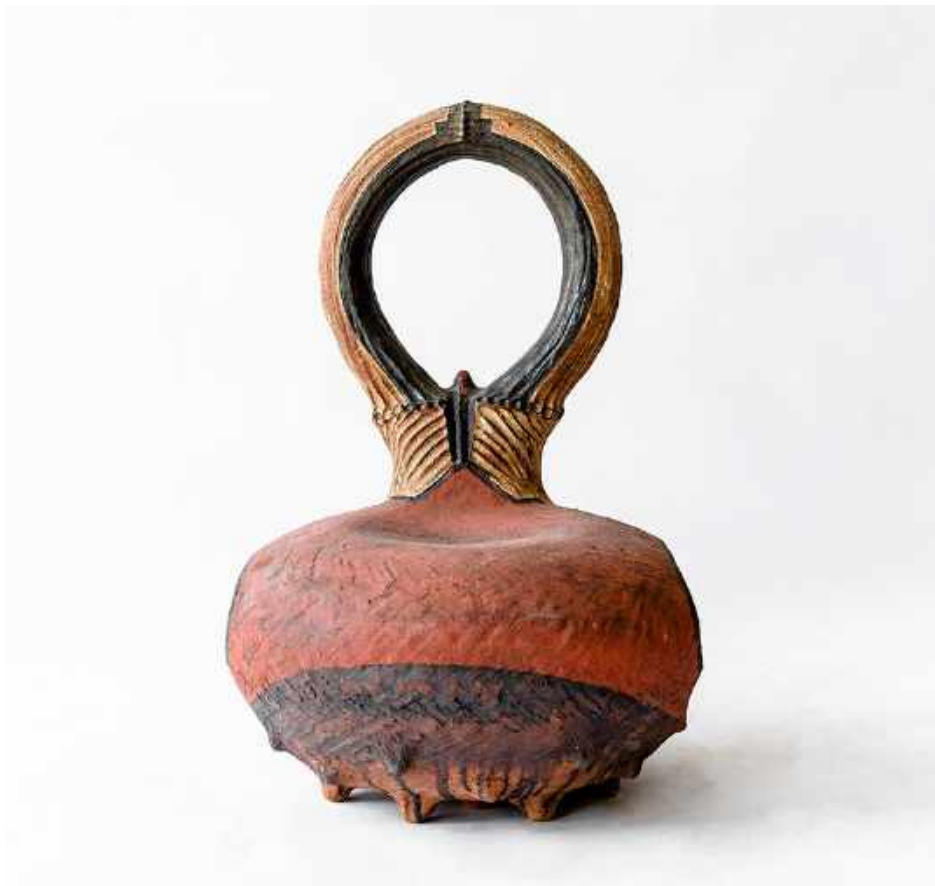
iGubu (drum) II