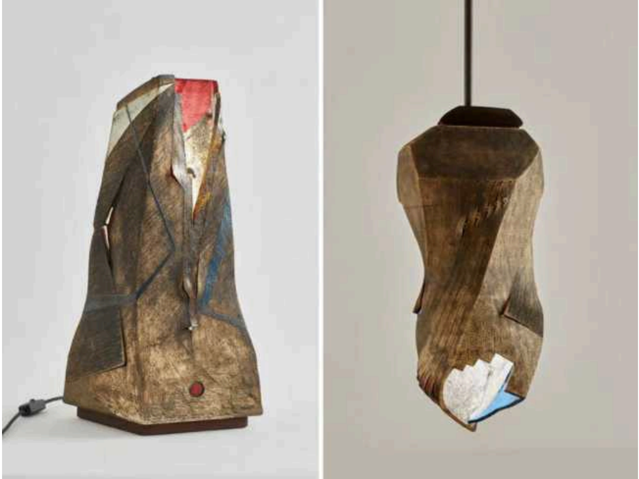
(left) gudu II (medium), clan of my mother, 2016 / (right) ngwanya II, praise name series, 2016

iThongo comprises an extensive collection of sculptural ceramic seating that pays homage to his ancestors. meaning 'ancestral dreamscape' in xhosa, iThongo refers to the medium through which messages are transmitted from the ancestors. the sculptural stools, chairs and benches are exhibited in the custom of xhosa ceremonial gatherings, in a circular arrangement around a fire hearth and herbal offerings. the intricate form of each object is based on a single pictogram or glyph from a series of nearly 200 symbols that dyalvane has created to denote important words in xhosa life – such as entshonalanga (sunset), igubu (drum), umalusi (herdsman) and izilo (totem animals). taking their inspiration from both dyalvane's personal memories and various african artefacts, the seating objects sit close to the earth, as the ground is revered as an ancient portal for ancestral communion.