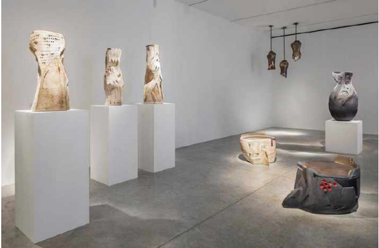
exhibition view of 'andile dyalvane: camagu' at friedman benda in 2016