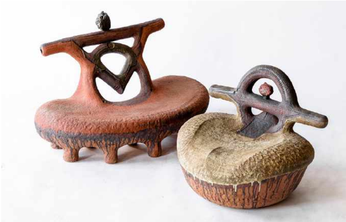
uMama and uMpumalanga