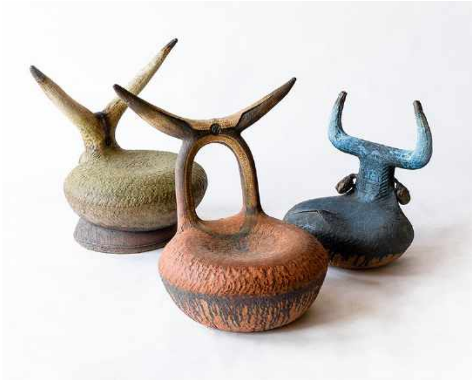
uMnga, iNkomo, and iZilo