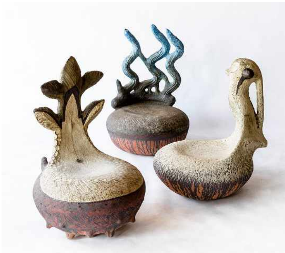
uTyani, iMpepho, and uMalusi