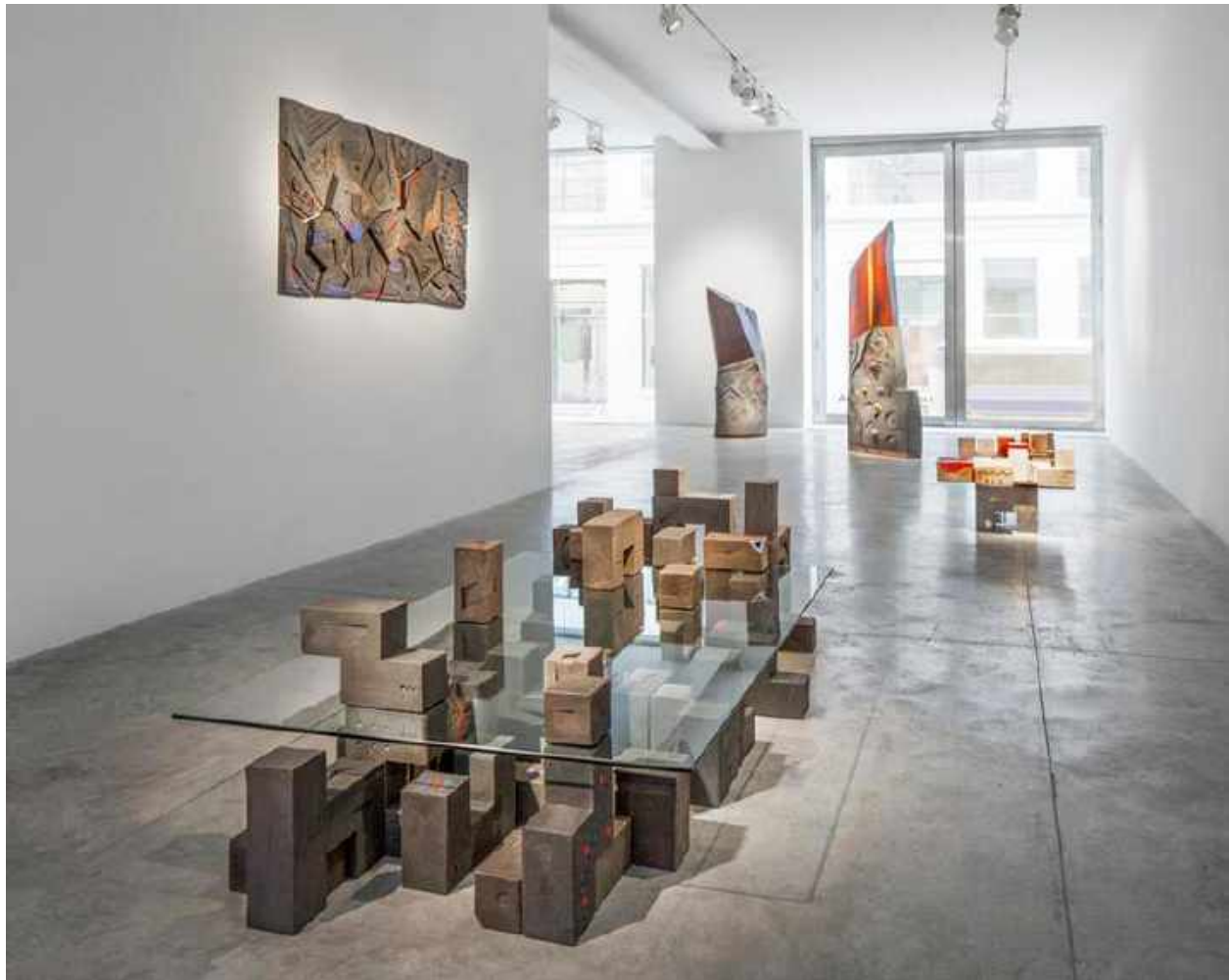
Exhibition view of 'andile dyalvane: camagu' at friedman benda in 2016

watch the full video interview at the top of the page and stay tuned as designboom continues to share design in dialogue features. see all past episodes – and RSVP for upcoming ones – here .