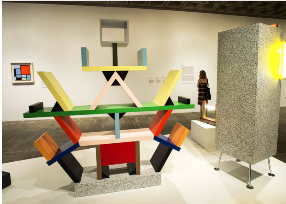
From left, a Mondrian painting; a Carlton Room Divider (1981) by Sottsass for Memphis; and his modular storage unit for Studio Alchymia (1979). The designer slyly merged painting, sculpture and furniture with the spirit of architecture.

Unsurprisingly, “Ettore Sottsass: Design Radical” at the Met Breuer has a combative air. You may argue your way through it, and also take issue with some of its contextual artworks — this show is nearly half non-Sottsass — but it is an invigorating, illuminating experience.