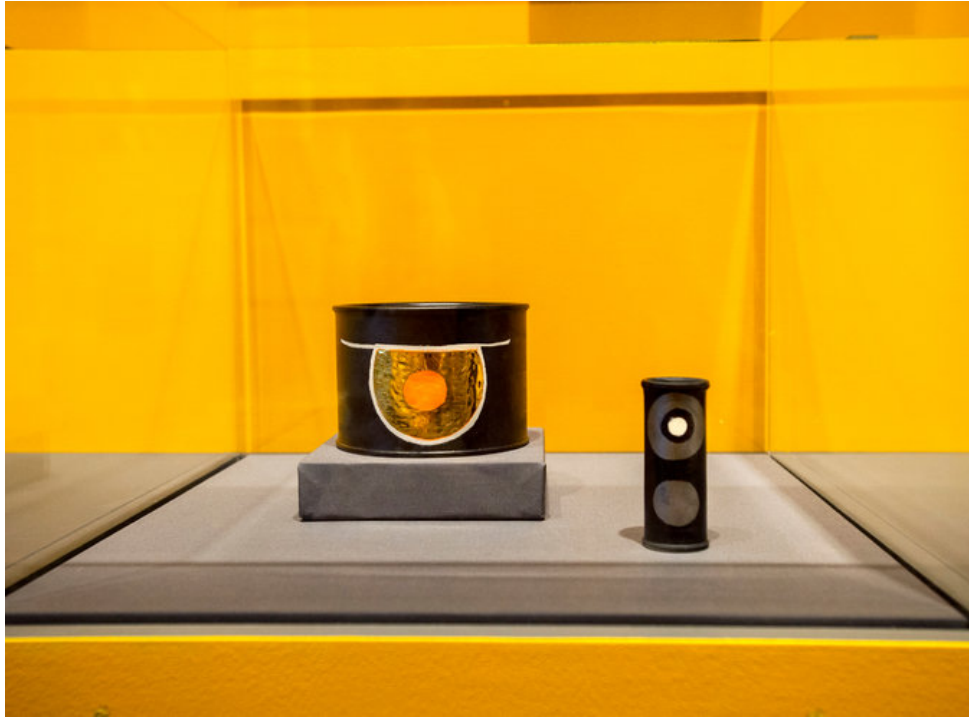
Tenebre (Darkness), a series of ceramic vases by Sottsass. 2017 Ettore Sottsass/Artists Rights Society (ARS), New York; Philip Greenberg for The New York Times

beyond the maquette stage and are present here only in a 1972 film that Sottsass made with Massimo Magri, and two excellent drawings.