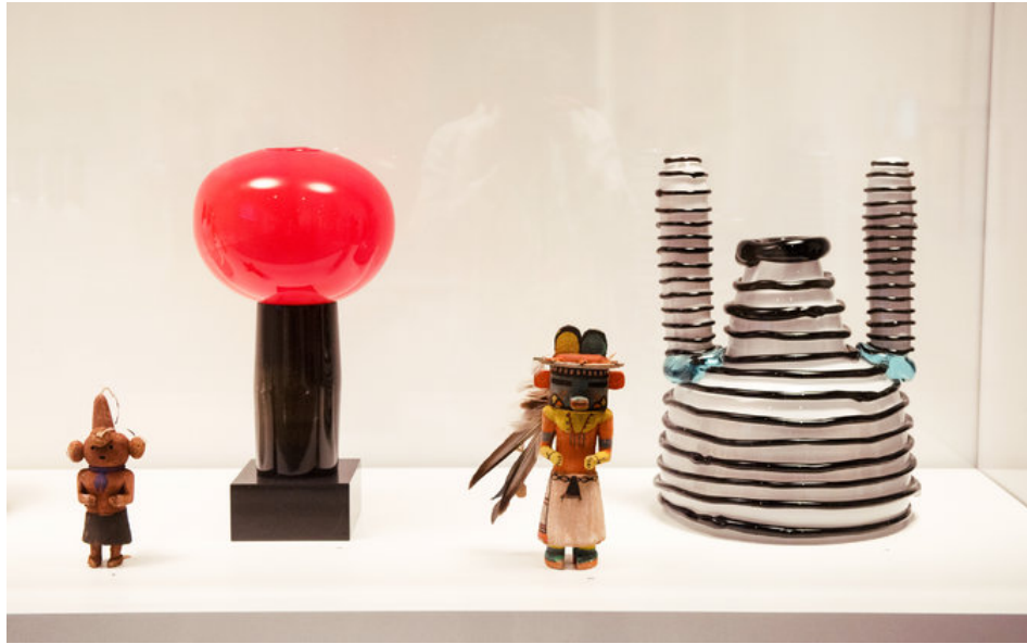
From left, two Hopi kachina figures, which inspired two blown-glass objects by Sottsass, from 2007.