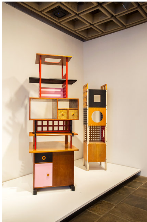
Early furniture designs by Sottsass include Tower Furniture (1960-63), in wood, paint and gold leaf, and the Commode column (circa 1965), made of laminated wood and painted steel.

Unsurprisingly, “Ettore Sottsass: Design Radical” at the Met Breuer has a combative air. You may argue your way through it, and also take issue with some of its contextual artworks — this show is nearly half non-Sottsass — but it is an invigorating, illuminating experience.