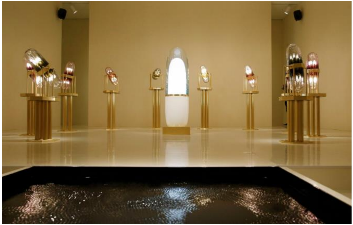
"Theoracle," by Ini Archibong is pictured on Tuesday, Nov. 5, 2019 at the Dallas Museum of Art where it's included in the exhibition "Speechless: Different by Design."

Inside the exhibition hall at the DMA, a central foyer greets visitors with some ground rules: "Be curious, be thoughtful, be gentle." (Translation: Yes, you can touch — just go easy, OK?) Braille booklets with information about the show are available near the entrance. The space is laid out choose-your-own-adventure style. Artists who contributed to the show have their own rooms to the left and right.