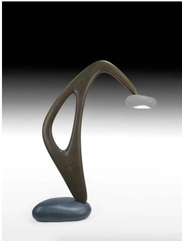
Philly Lamp, 3019. Courtesy of Friedman Benda and Daniel Arsham.

"Distorted Futures: Daniel Arsham for Friedman Benda," NESS Magazine , December 8, 2019.