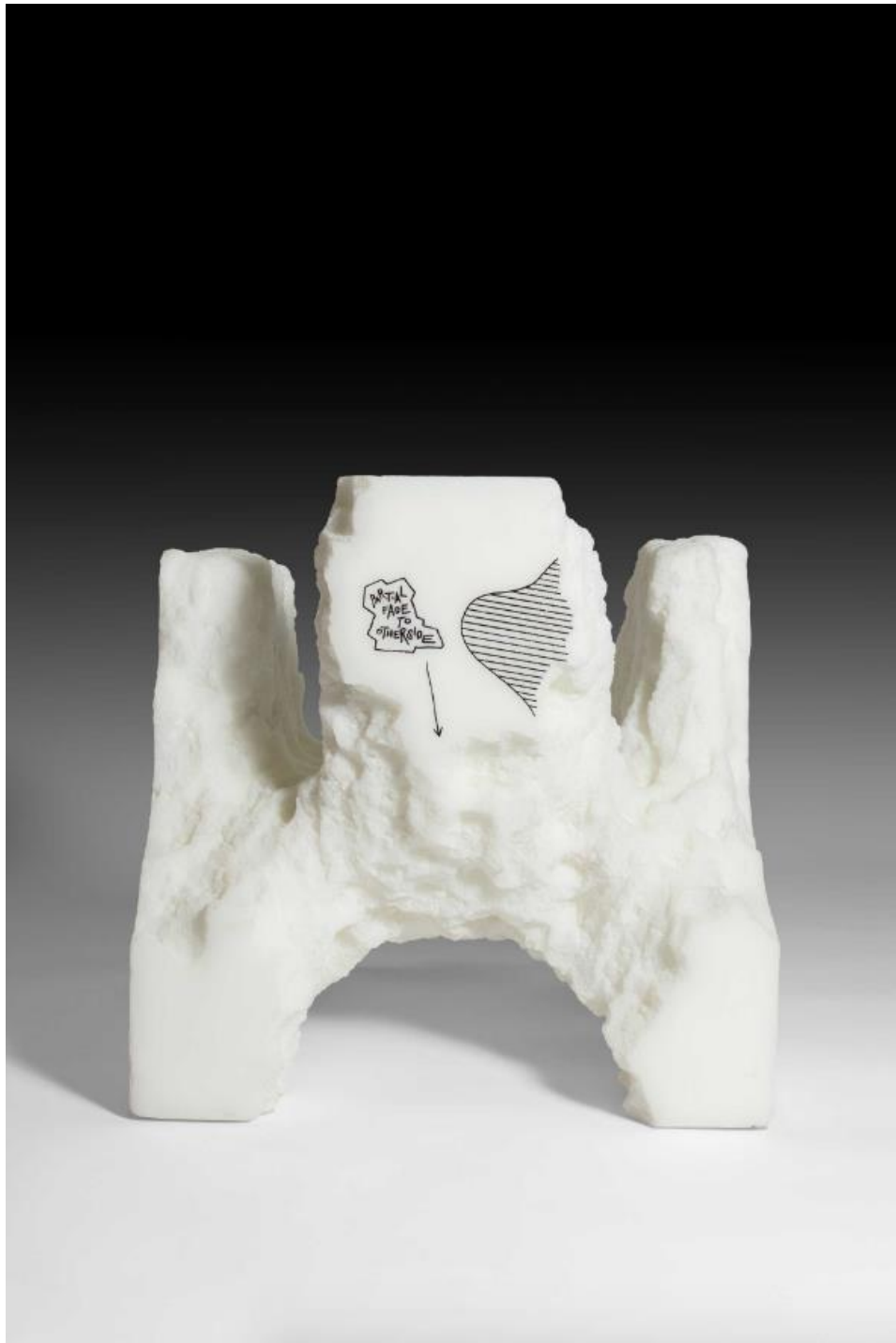
Shanghai Chair, 3019. Courtesy of Friedman Benda and Daniel Arsham.

DATES: December 3 – 9, 2019 / LOCATION: Design Miami / GALLERY: Friedman Benda / / TEXT: Adapted from the press release by NESS