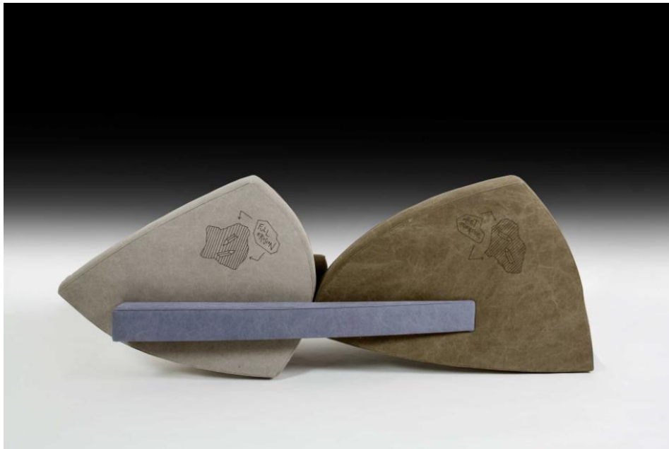
Paris Chaise Lounge, 3019.