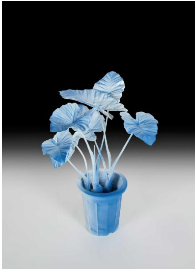
Bronze Plant, 3019. Courtesy of Friedman Benda and Daniel Arsham.