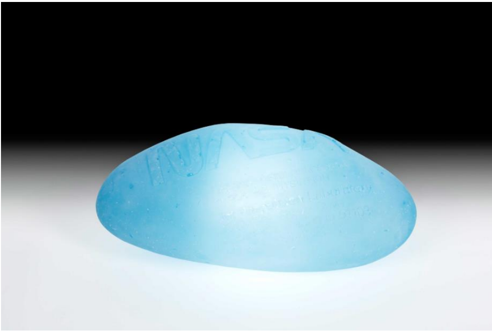
Pasadena Sea Glass Lamp, 3019.