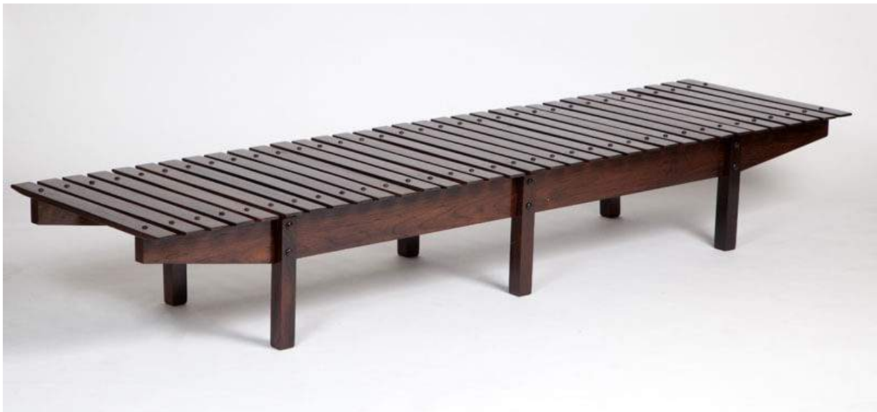
Sergio Rodrigues, 'Mucki Bench', 1958

Piasa's Brazilian Design sale on December 10th 2020 underscored the growing demand for works that leading modernists José Zanine Caldas, Joaquim Tenreiro, Oscar Niemeyer, Jorge Zalszupin and Sergio Rodrigues created in Brazil from the 1950s to the 1970s. It illustrated the designers' predilection for rounded lines, organic forms and wood as a material.