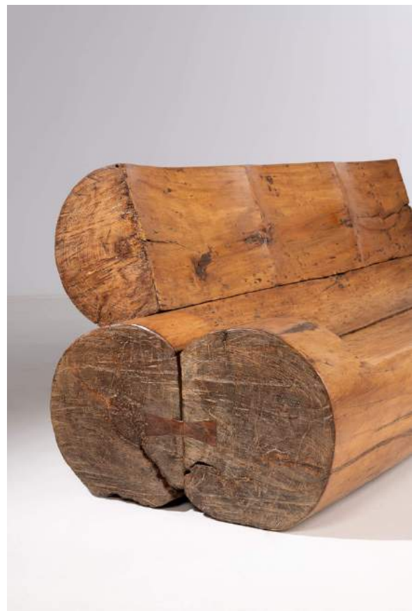
José Zanine Caldas, 'Sofa de Troncos', 1977 (detail)

“... The economic boom of the years that followed attracted more foreigners to Brazil, which helped to nurture a market”