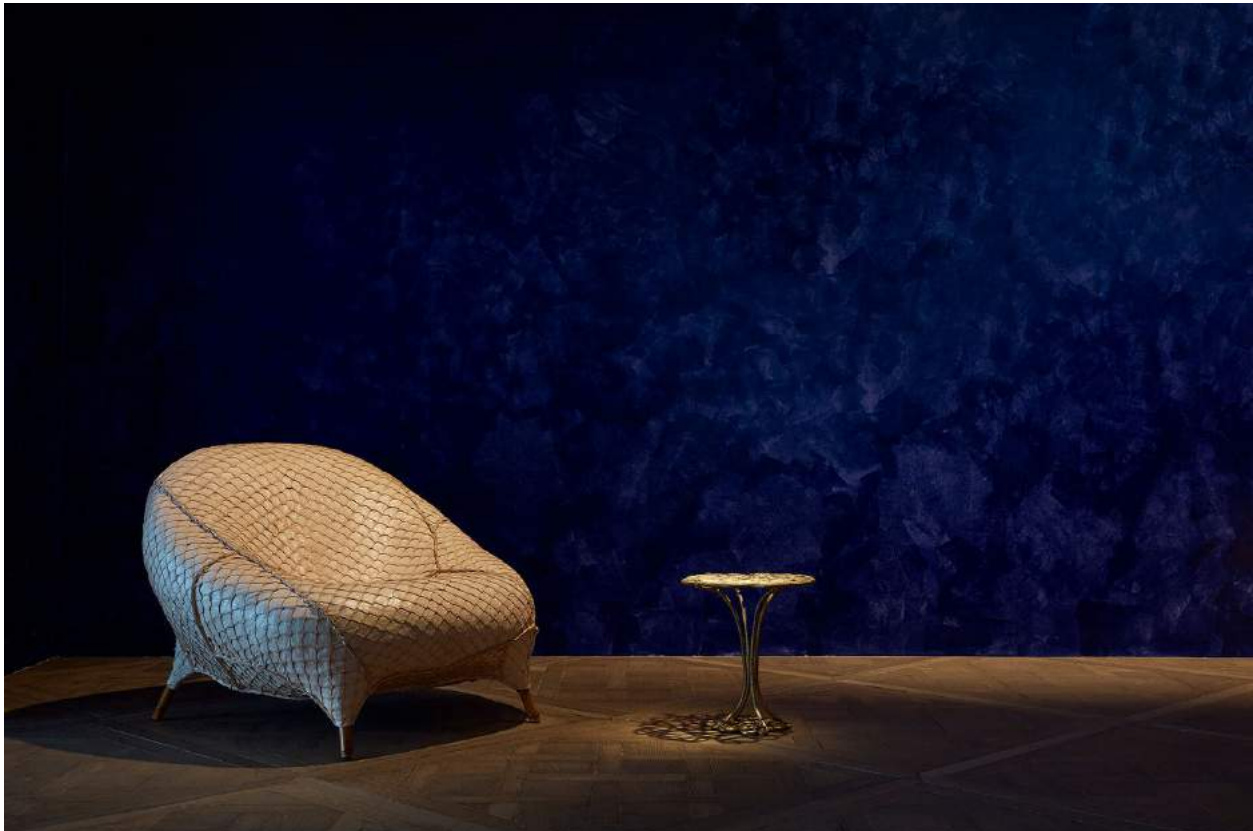
Fernando and Humberto Campana 'Hybridism' exhibition: 'Pirarucu armchair (Pink)', 2015; 'Ofidia Side Table', 2015

The work of the Campanas can be found in the collections of the Centre Pompidou and Musée Des Arts Décoratifs in Paris, the Vitra Design Museum in Weil am Rhein, Germany, and the Museum of Modern Art of São Paulo. The brothers are represented by Firma Casa in São Paulo, Giustini/Stagetti in Rome, Carpenters Workshop Gallery and Friedman Benda, after being initially supported by Moss Gallery, and pieces also appear at auction. Last February at Phillips auction house in London, a KAWS Chair Black, from a collaboration in 2018 with the artist KAWS, sold for £118,750 against an estimate of £70,000 – £90,000.