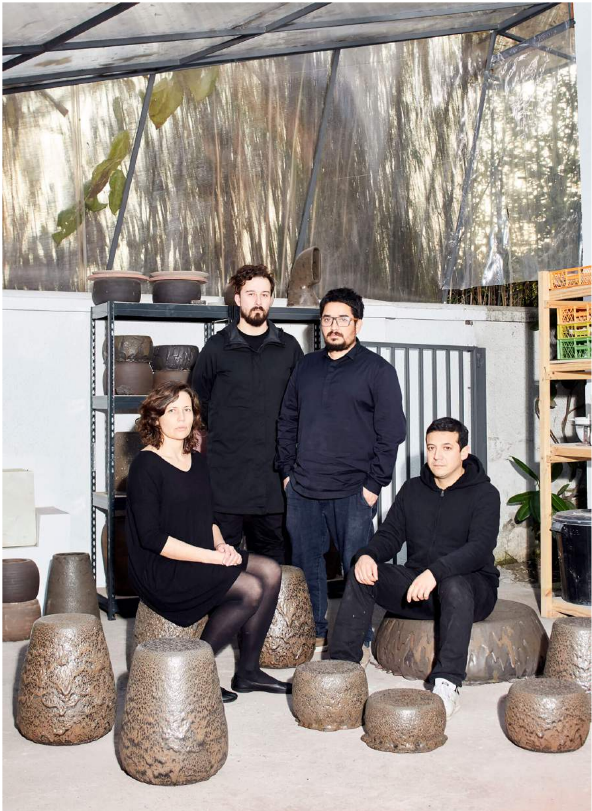
Members of gt2P studio