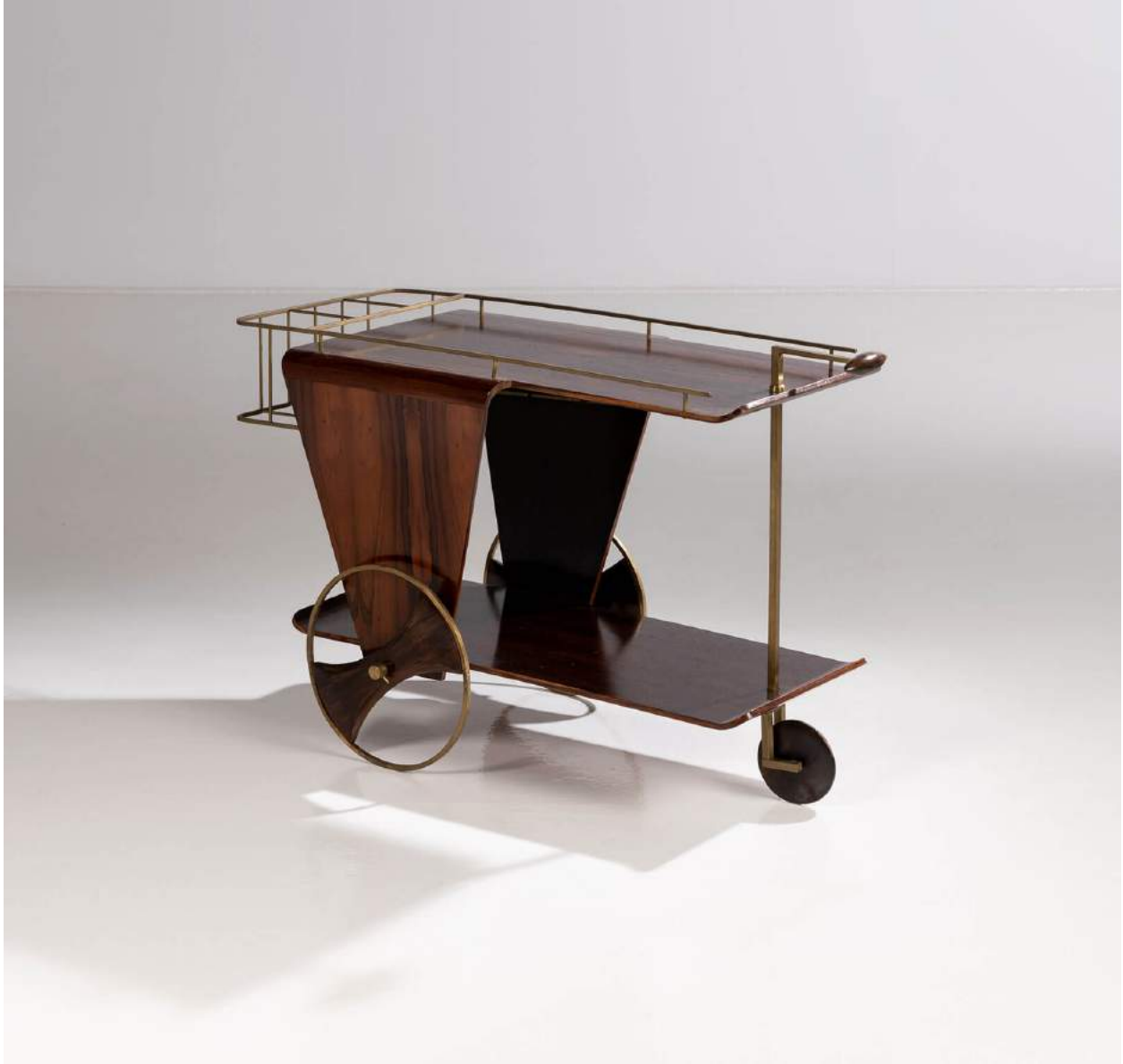
J.D. Decoracoes (XX), 'Trolley sideboard', circa 1950

Brazilian Modernism emerged as a synthesis of ideas brought over from Europe and their assimilation by Brazil's own designers. A pivotal event was the Modern Art Week in São Paulo in 1922; six years later, the first Modernist house, Casa Modernista, by Ukrainian-born architect Gregori Warchavchik was constructed. Portuguese-born Tenreiro, Polish-born Zalszupin, Italian-born Lina Bo Bardi, and Carlo Hauner and Martin Eisler, who were Italian and Austrian respectively, all immigrated to Brazil, encountered local designers and embraced the use of natural materials, such as wood and caning. The furniture pieces that Tenreiro made for Hotel Cataguases, designed by Niemeyer, exemplify his contribution to Brazilian interior design. Moreover, Niemeyer's architectural design of Brasília, Brazil's federal capital – for which Lúcio Costa was the urban planner – helped shape the modernist vision.