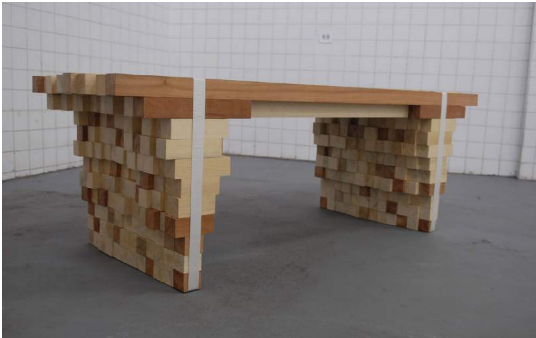
Mameluca, 'Uiurar', 2014

The younger generation of designers is adopting a different, more conceptual approach in their work. Vicente and Vasconcello from Mercado Moderno refer to how Mameluca Studio (founded in Rio de Janeiro in 2010) "manages to create pieces with a clear influence of the works by [the artist] Lygia Clark but at the same time absolutely innovative." For instance, for the 'Uiurar' (2014) series of multi-functional furniture, the studio bound and tied pieces of wood using ratchets, drawing inspiration from the mooring method used by Brazilian indigenous tribes.