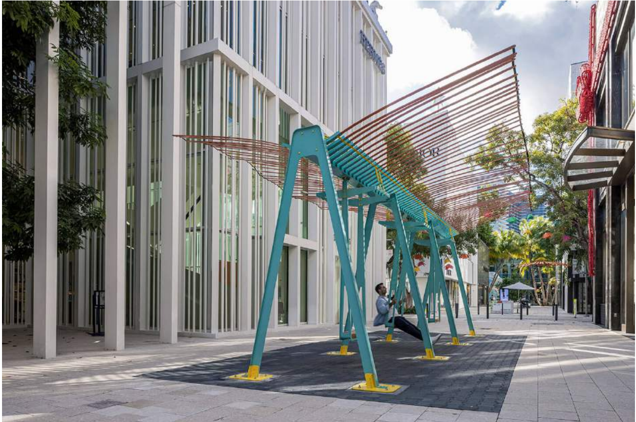
gt2P, 'Conscious Actions' swing, 2020

ELSEWHERE IN LATIN America, a rich diversity of studios is gaining international acclaim. Among these is the Chilean studio gt2p (Great Things To People). For Design Miami/ Podium earlier this month, gt2p was commissioned to make a temporary, outdoor installation, 'Conscious Actions': a turquoise structure with three swing seats and overhead red wings that rippled with each swing's movement.