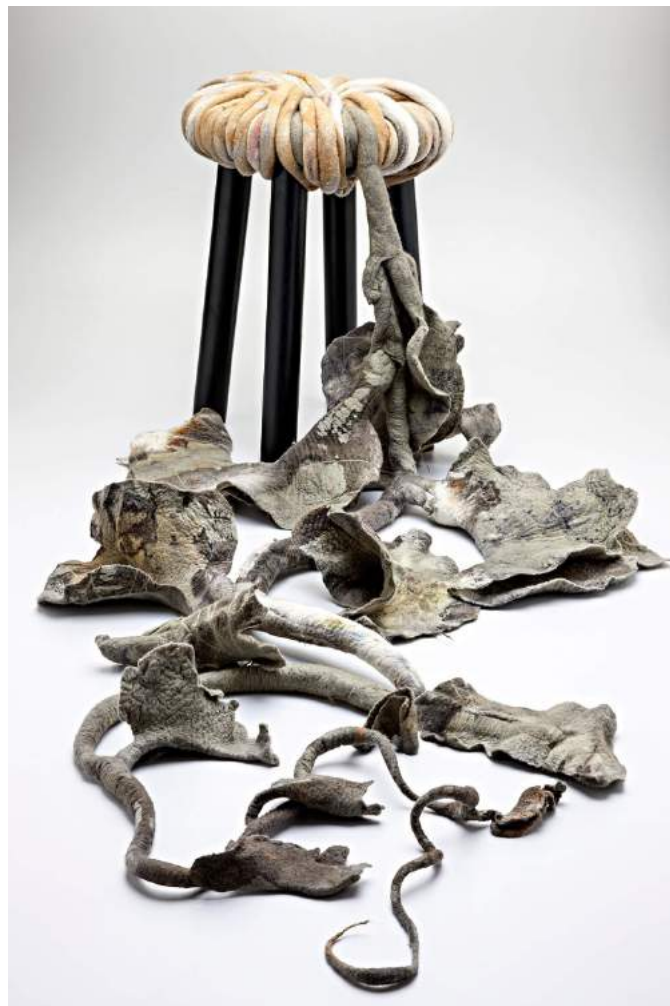
Inês Schertel, 'Banco Hera', 2018.