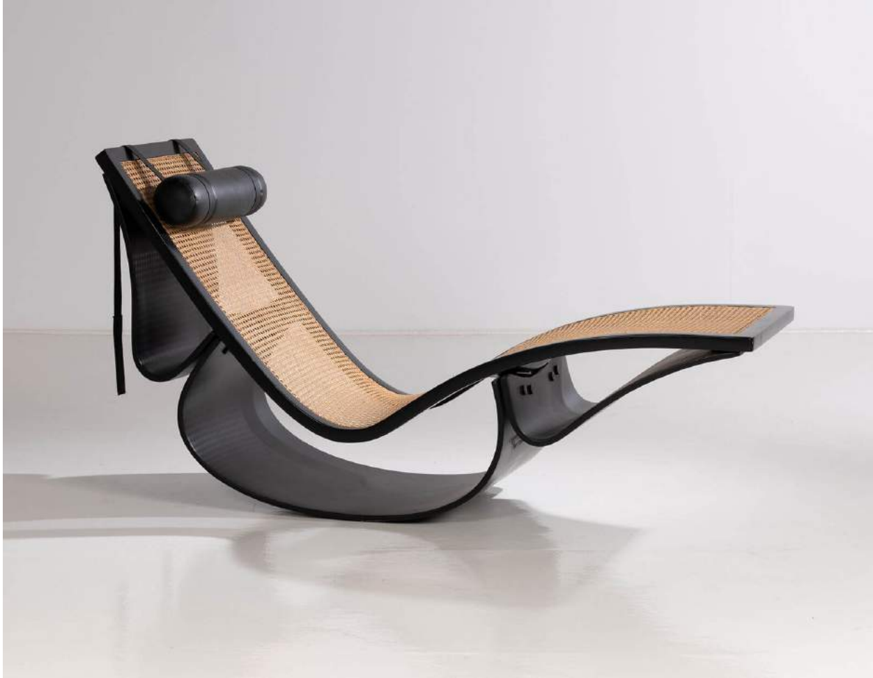
Oscar Niemeyer, 'Chaise Rio', 1977