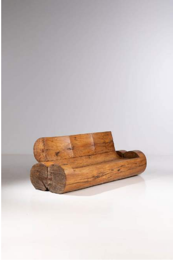
José Zanine Caldas, 'Sofa de Troncos', 1977

“In the early 2000s, modernist furniture was despised, donated and considered something of low value ...”