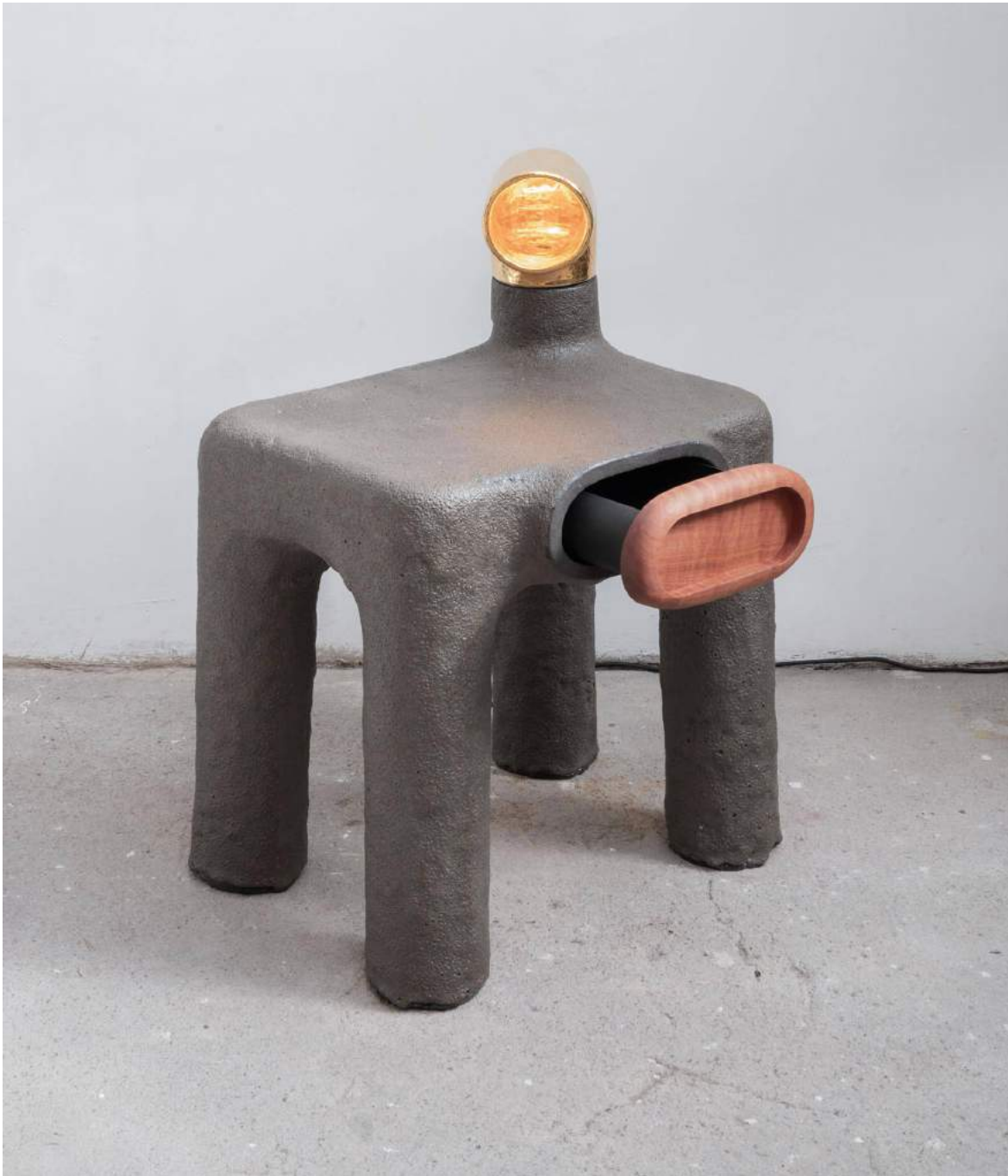
gt2P, 'Remolten Monolita' side table, 2020

Research being crucial to gt2p's practice, an earlier project, 'Remolten' (2017), which was exhibited at London's Design Museum in 2018, developed from research into volcanic lava. Lava from four of Chile's 2,000 volcanoes underwent various processes of being granulated, remelted and cooled in order to create stoneware objects. "Although the project was born from research in a particular region of Chile, the knowledge produced there is universal in investigating a raw material found in many parts of the world," Parada says.