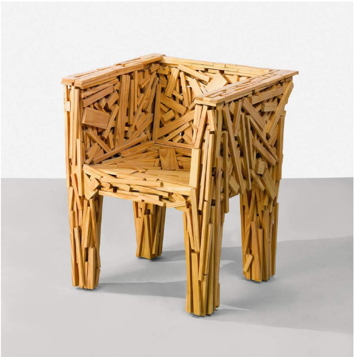
Fernando and Humberto Campana, 'Favela' chair, 2003

Vibrant, tactile and humorous, the Campanas are also driven by an ethic of sustainability and the desire to rescue and preserve artisanal technologies. This is seen with the 'Favela' chair (circa 2003) haphazardly made from small, narrow pieces of Brazilian Pinus wood, one of which sold at Sotheby's New York in 2013 for $10,000. Think, too, of the chairs and sofas made from soft stuffed animals, such as the 'Dolphins and Sharks' (2002) chair, and the 'Sushi' and 'Harumaki' (2002-2014) furniture collections made from carpet-and-rubber rings.