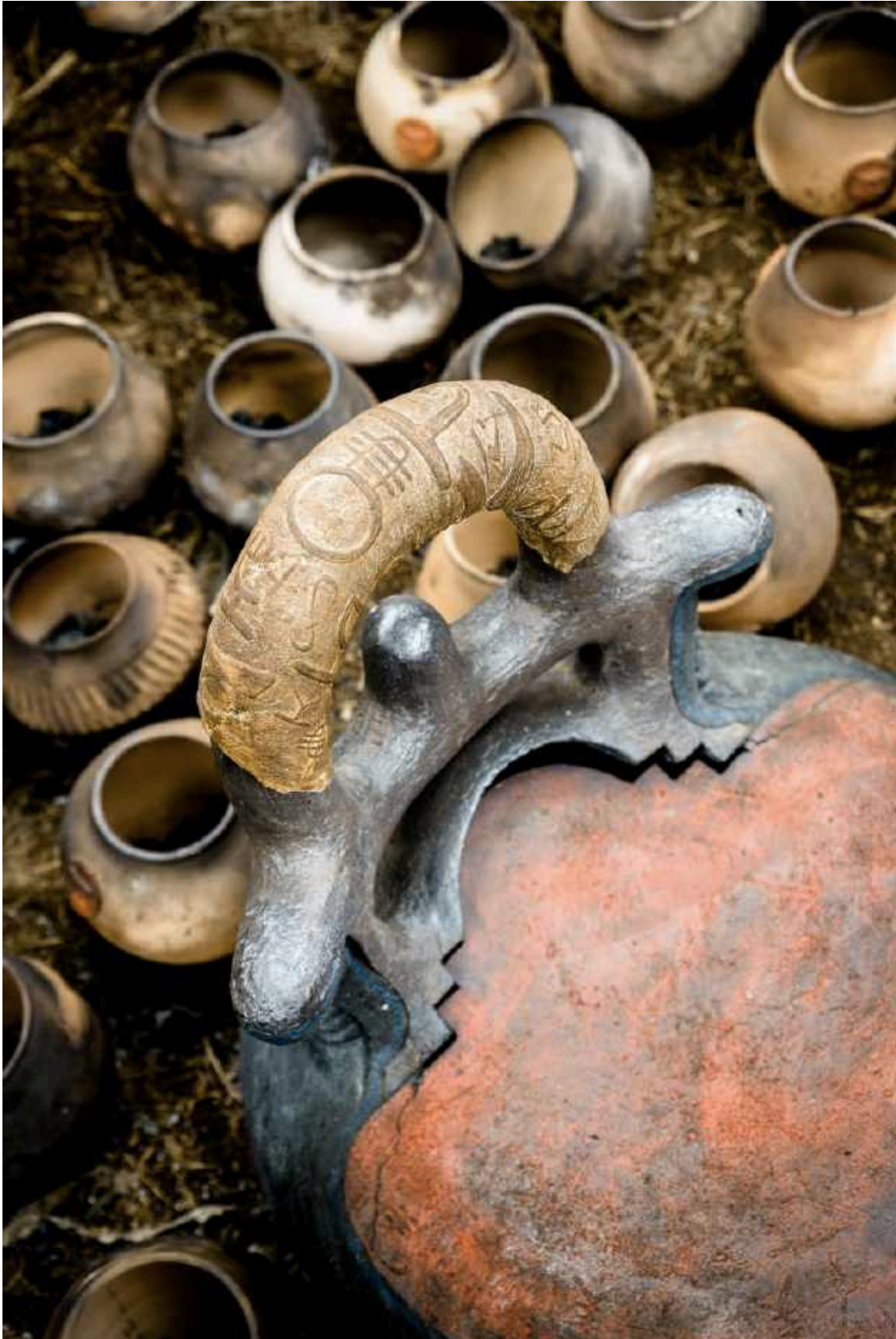
Detail shot of the 'Ikhaya' stool, meaning home. 'Home is in essence familiarity,' says the designer