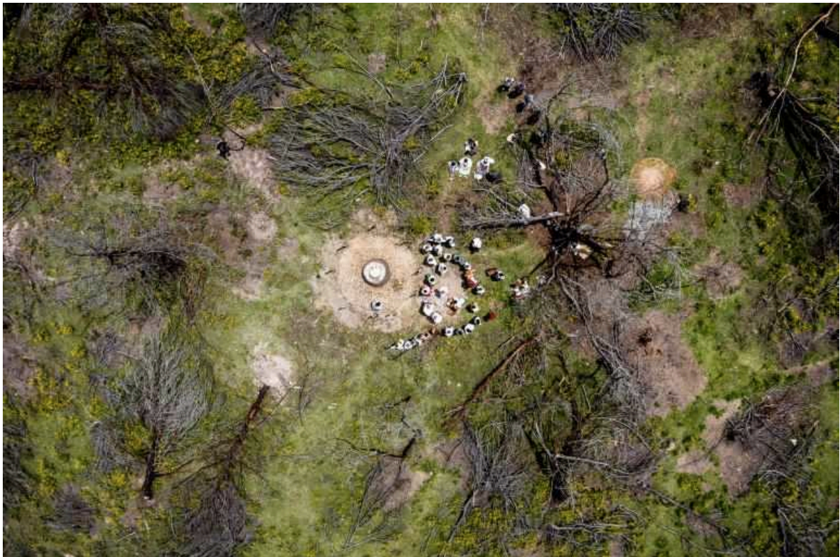
Another aerial view from Dyalvane's visit to Ngobozana, Eastern Cape