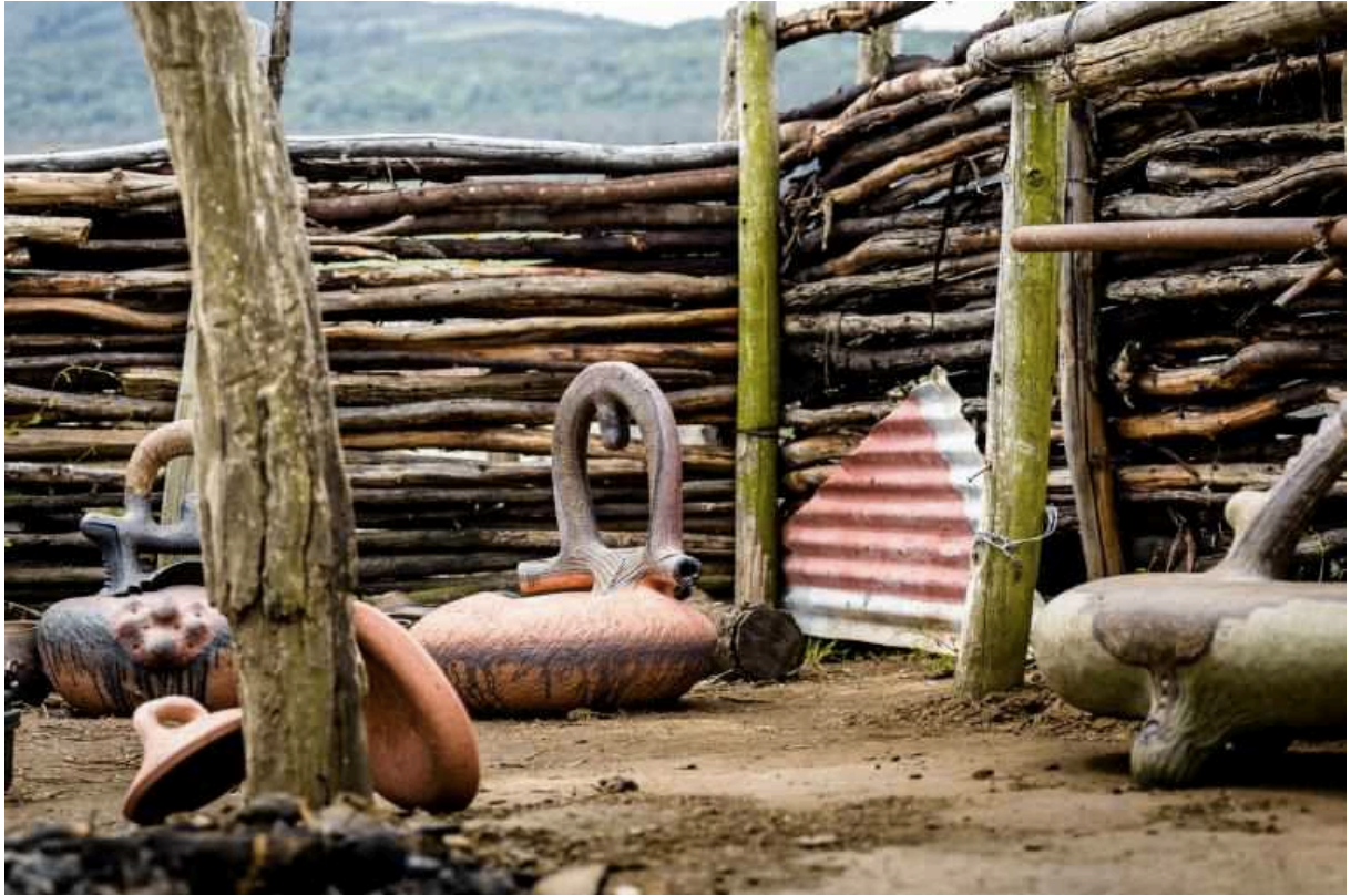
Pieces from the 'iThongo' collection photographed in Ngobozana, Eastern Cape