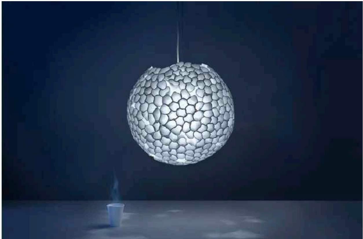
© Styrene by Paul Cocksedge for the Stepney Green Design Collection

An unfocused picture of the sun I took in Crete , sending out 360 degrees of glowing energy.