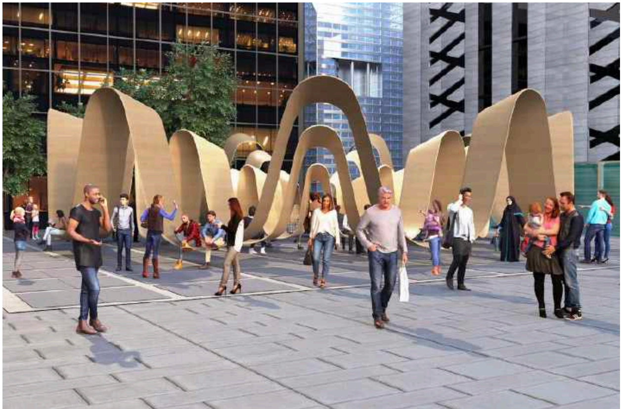
© Please Be Seated by Paul Cocksedge