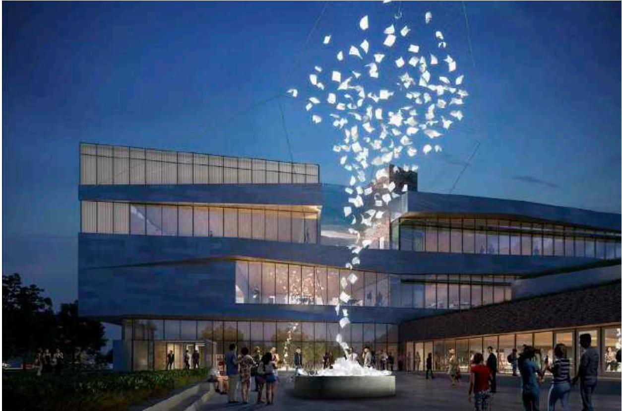
© Unbound by Paul Cockledge at the Norman Central Library