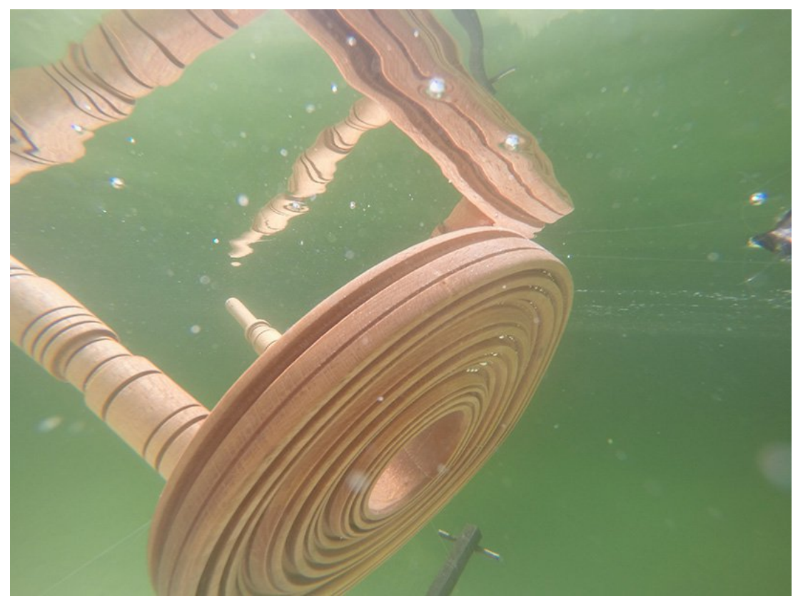
the sea is considered by the designer to be the 'most vegan place on earth'