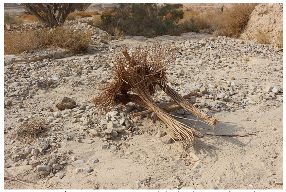
a series of woven containers are polished with a special varnish