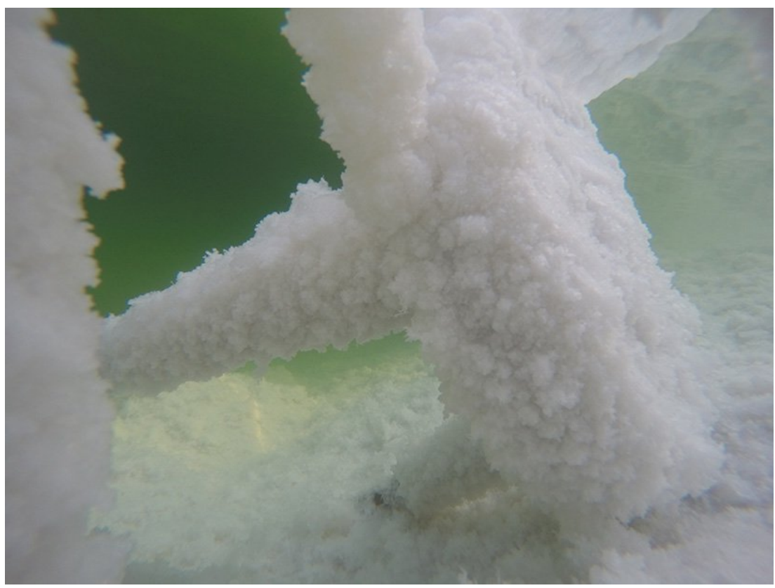
the technique gives a new shape and thickness to the stool