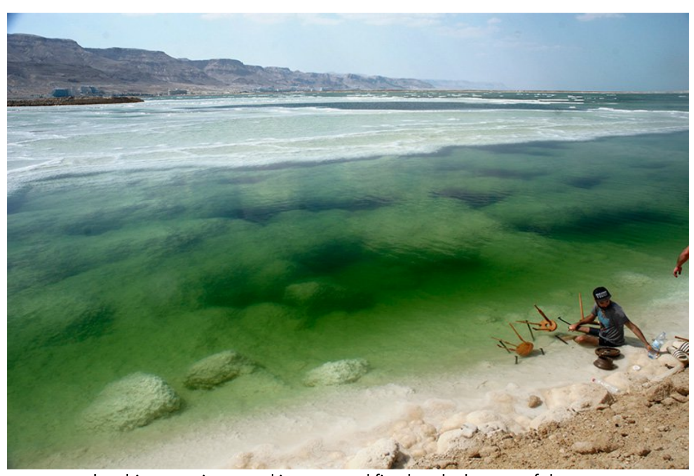
the objects are immersed in water and fixed to the bottom of the sea

lot's wife, a series of vegan-clay objects, is also presented, as well as a collection of silk garments that are made without harming the creature. in creating the clothes, the designer awaits for the butterfly to exit the cocoon by itself and, only then, collects the silk deposited in it. 'vegan design – or the art of reduction by erez nevi pana' is on view from april 17-22, at milan's spazio sanremo.