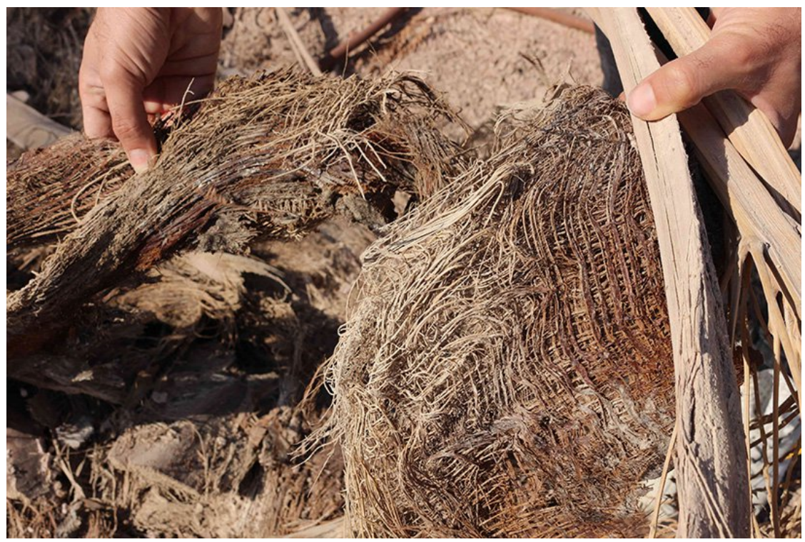
nevi pana paid special attention to the objects' beauty, color, and texture