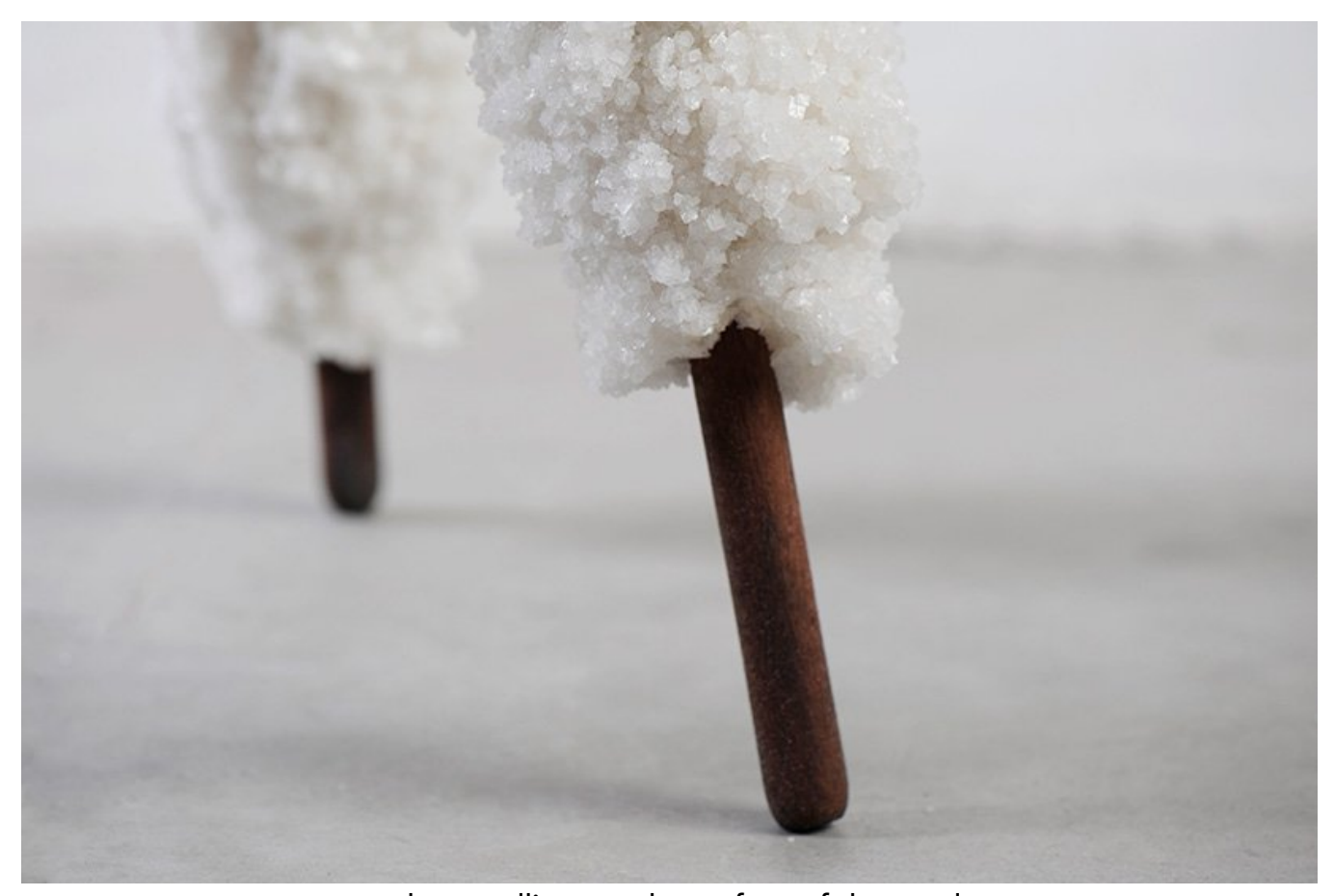
salt crystallizes on the surface of the stool

begins to crystallize on its surface. this dramatic technique gives a new shape and thickness to the stool with a layer of natural salt forming a unique new skin.