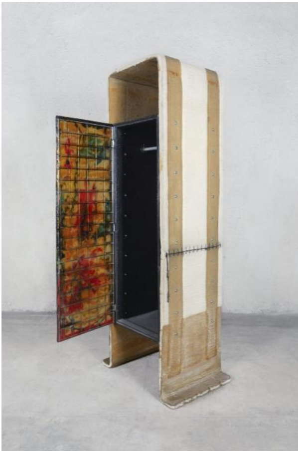
Felt Chest and Closet (Daniel Kukla, Courtesy Friedman Benda and Gaetano Pesce)

Perhaps the most interesting designs on view are the least aesthetically pleasing: Dacron-filled fiberglass cloth chairs— Golgotha (1972)—resemble the