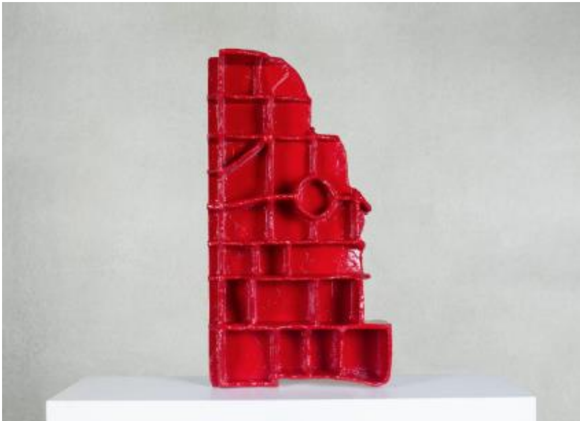
Model for Bookshelf in Red (Courtesy Gaetano Pesce)

functional version of a Piero Manzoni painting, and the garish, slick palette of his Golgotha Table (1972) provides a visually grating yet conceptually transcendent testament to Pesce's Roman Catholic upbringing. The designer's relentless openness to experimentation and earnest resistance to a consistent style is manifest in one of the more striking works in the exhibition is the monumental Moloch Lamp (1971), deftly placed behind one of the gallery space's pillars, allowing it to make an even more powerful impact once visitors are confronted with it in closer proximity. Pesce's most famous design, the Up5 (Donna) chair and Up6 footstool make a requisite appearance just beneath the lamp's intense metallic glow. The chair, which resembles the breasts or buttocks of the female body, is tethered to its spherical footstool, mimicking a prisoner's ball and chain. A recent demonstration by the feminist group Non Una Di Meno during Milan design week expressed explicit opposition to the design, yet Pesce insists that the work was intended to emphasize the restrictions of femininity in order to spur debate, rather than uphold traditional values pertaining to gender.