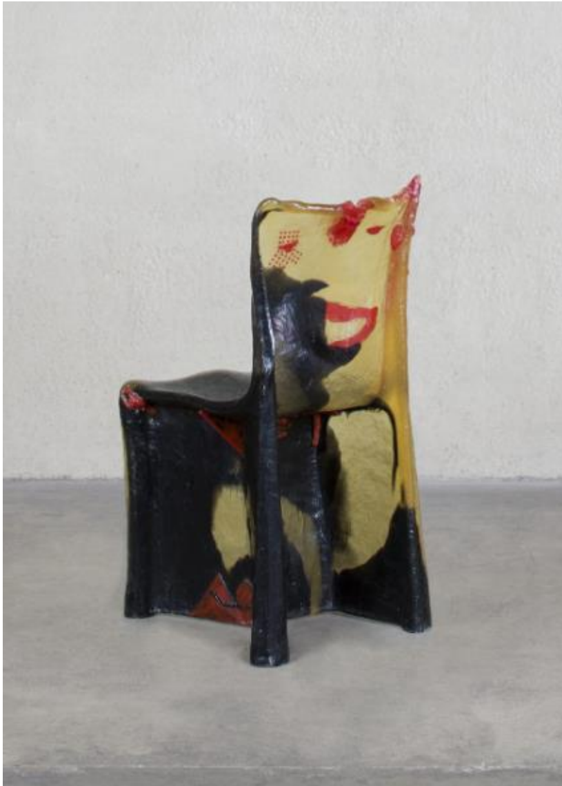
Pratt Chair 2

Never one to hang up his tools and retire, Pesce is making waves on the New York art and design scene at the moment. Coinciding with the Friedman Benda show, the revered talent has also moved a large part of his studio into Salon 94's new 86th street gallery space for a unique exhibition. Visitors are able to witness the artist in action; pouring resin and producing new work. Workinggallery runs through to the end of this week.