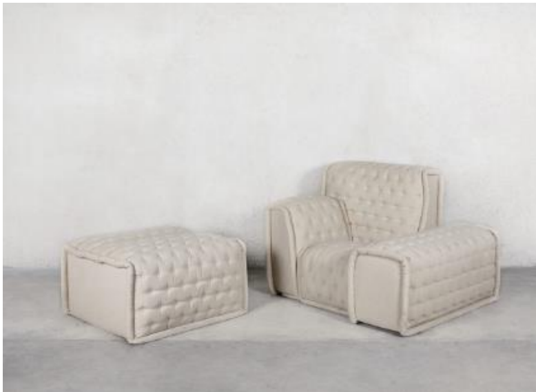
Yeti Armchair