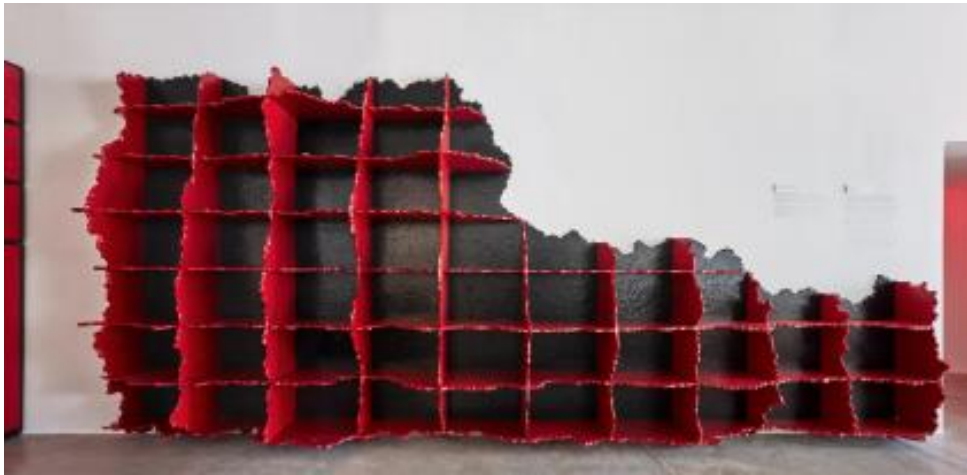
Carenza Bookcase