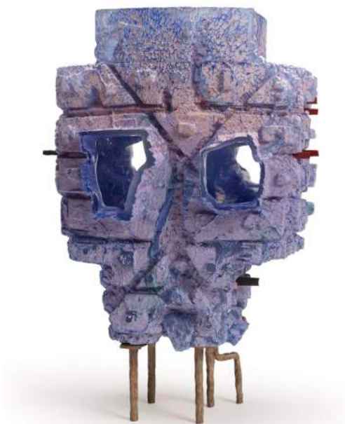
Left: Untitled , 2017, blown glass, bronze, 17.5 x 12 x 9 in.;