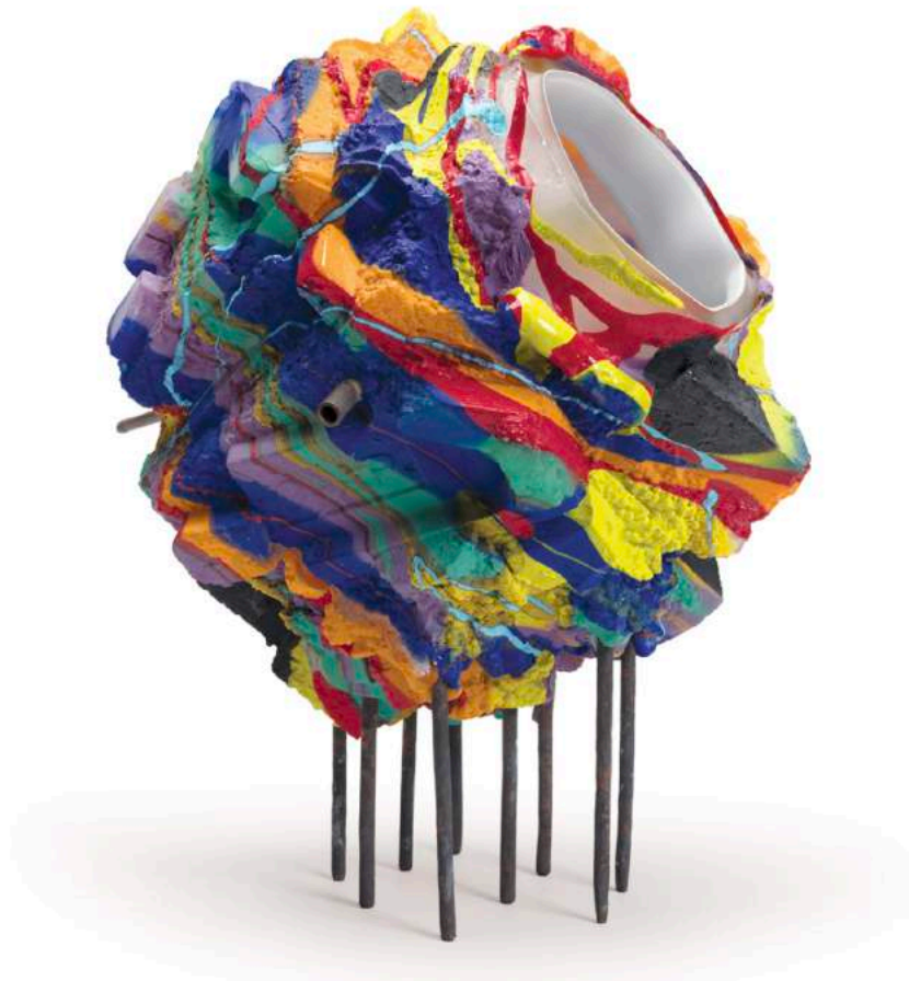
Wolfe says he’s moving away from the vessel “into an experimental architecture of form.” Left: Untitled , 2017, blow glass, bronze, 15.5 x 13.5 x 11 in.

“But,” he adds in his amiable, laid-back way, “it always takes a while.”