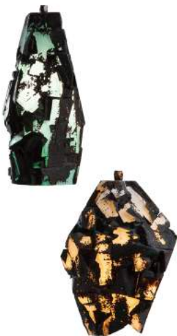
Left: Facet Assemblage pendants , 2012, cut and polished glass, 16 in. tall