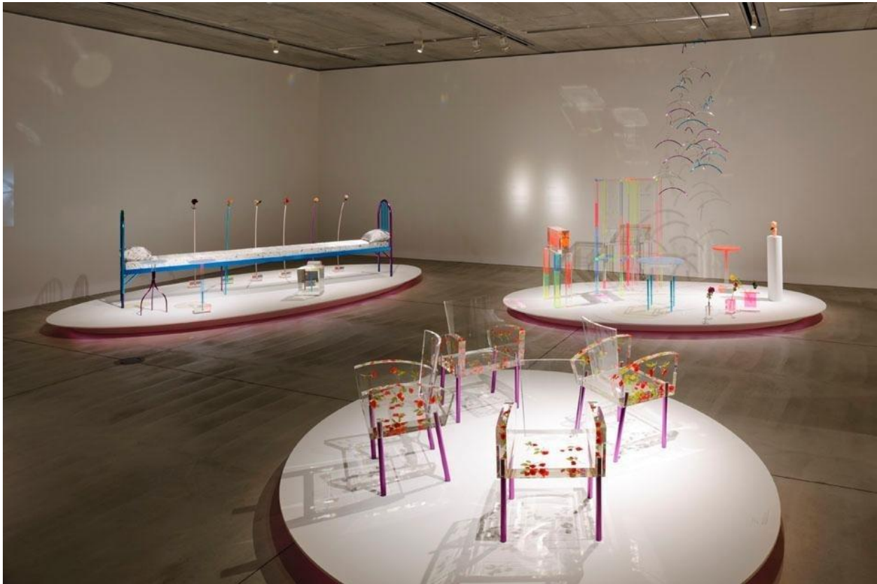
The exhibition features approximately 60 pieces of transparent and precious works created by Shiro Kuramata in the 10-year span from 1981.

The current times we are living in are very different from those when these two masters of design were to the fore. The 1980s, in particular, when Kuramata and Sottsass cultivated their friendship, was a golden age for Japan, which aspired to being the number one nation in the world. A time when the economic miracle of the Rising Sun prompted people to take an interest in the quality of life and in design. Thirty years on, the widespread use of information technology and the Internet as too the lesson taught by globalisation are making us wonder "What is design?" once again.