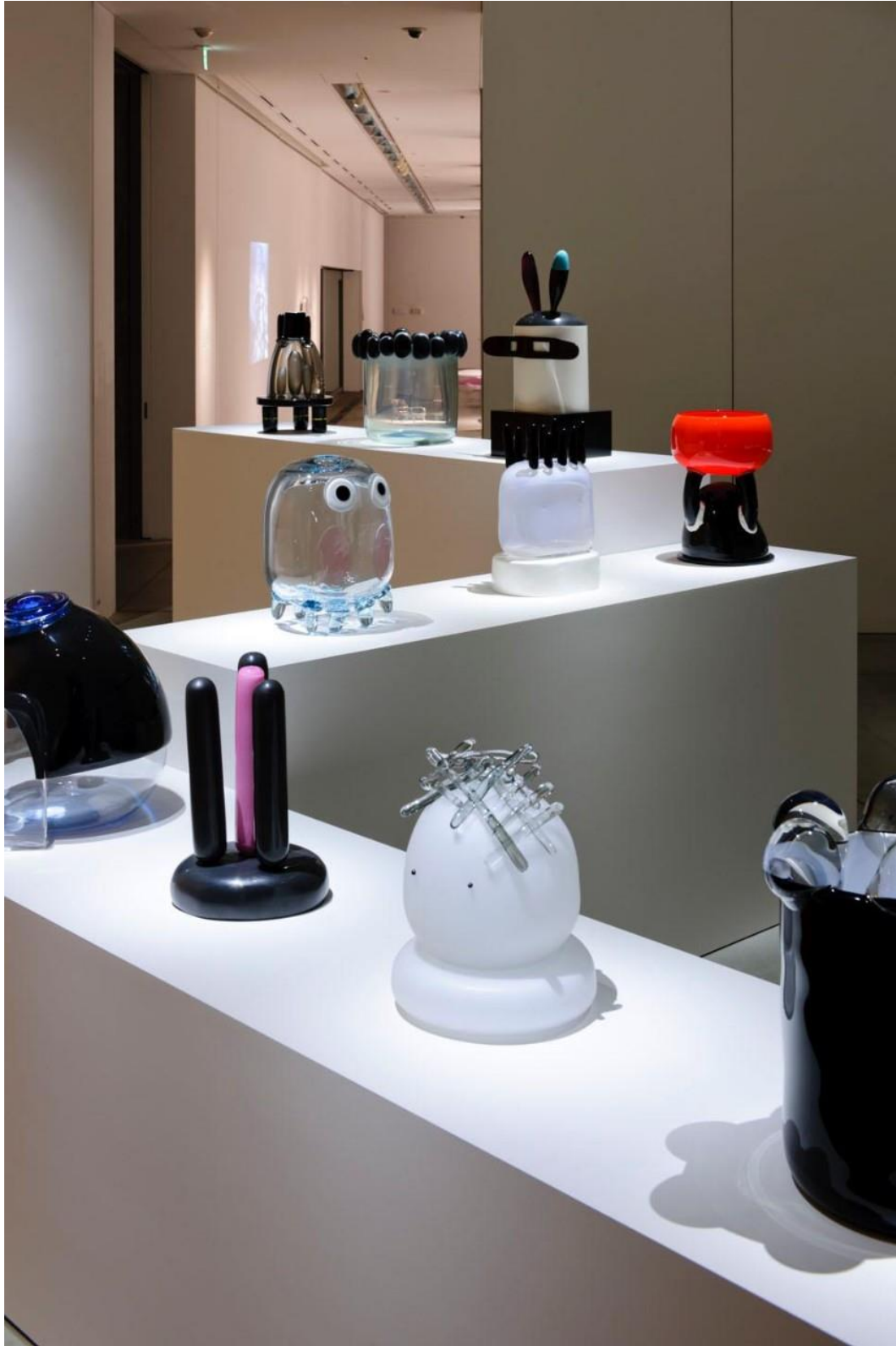
The exhibition features approximately 20 never-seen-before art pieces based on Ettore Sottsass's drawings created in 2004, inspired by the Native American doll "Kachina." The vases has been produced by Belgian gallerist Ernest Mourmans and CIRVA Marseille