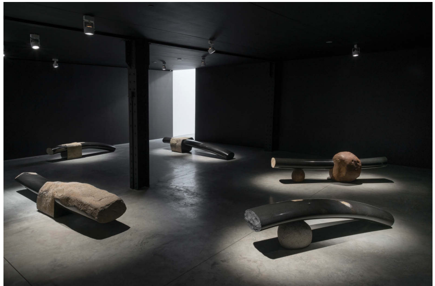
Byung Hoon Choi, "In One Stroke," 2014, dimensions variable, installation view. Friedman Benda.

calling to mind solid and illustrated instances of spatial manipulation.