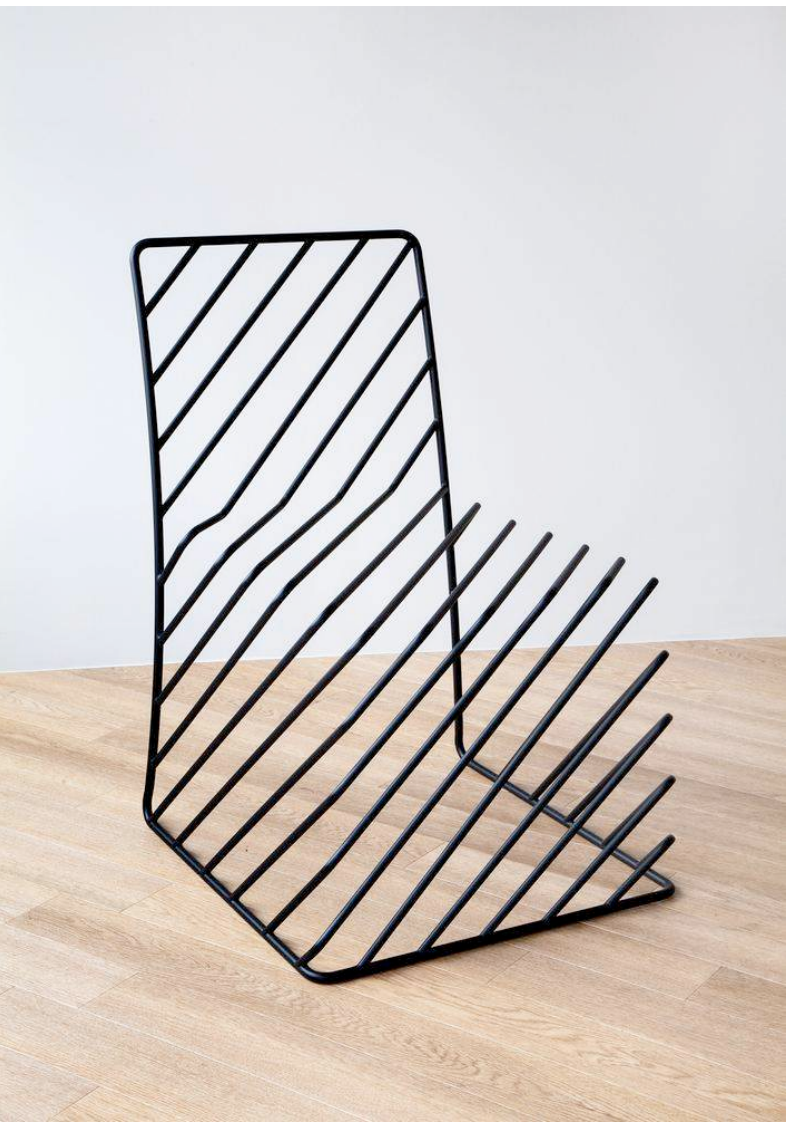
CHAIR APPARENT I A piece by Oki Sato of Nendo, part of a solo exhibition, 'Thin Black Lines,' that debuted at London's Saatchi Gallery in 2010.

Less is more for the prolific designer behind Japanese design studio Nendo, whose distinguished minimal aesthetic remains the DNA of his latest works to be shown in several upcoming exhibitions