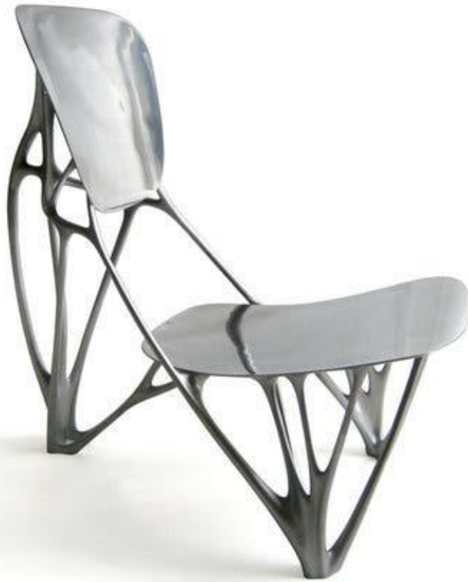
The Aluminum Bone Chair, 2006.

But the cast-aluminum Bone Chair is a big deal. Remember when Dolly the sheep was cloned in Scotland back in 1996?