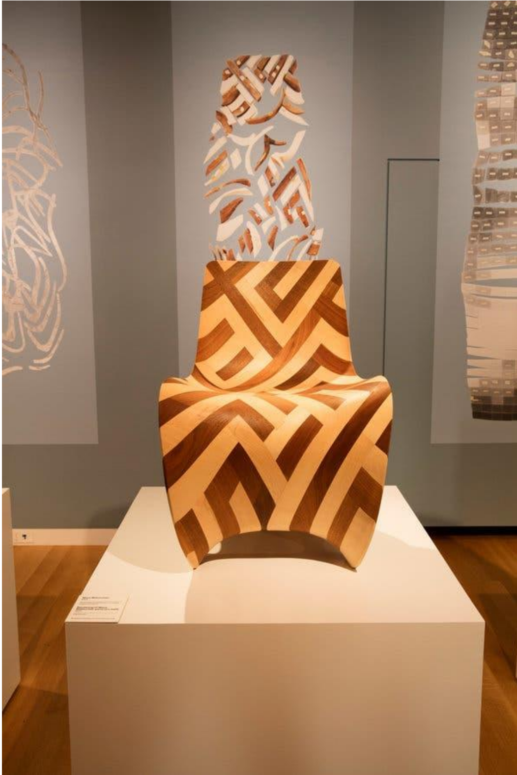
The Maze Maker chair, constructed from CNC-milled walnut and maple that is then hand-finished. The milling machine is controlled by a computer program that follows a digital blueprint.