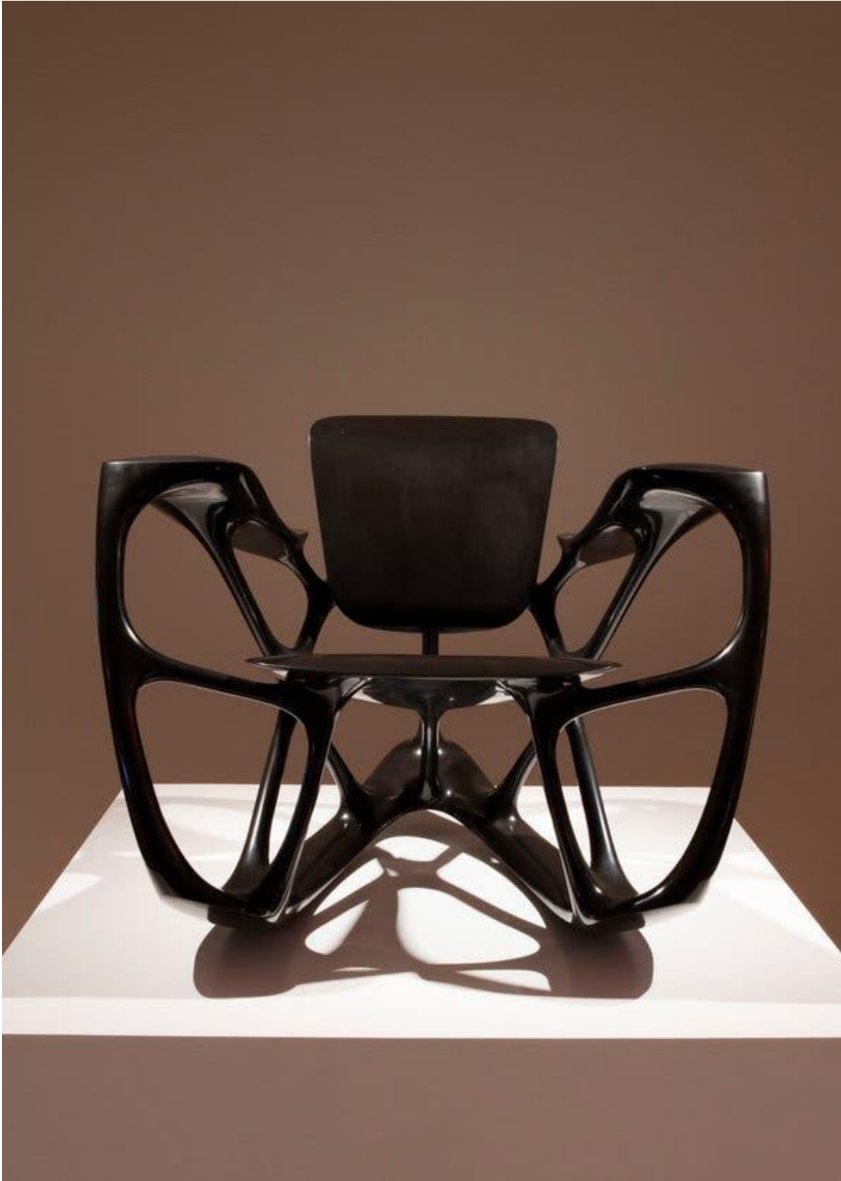
Bone Rocker by Joris Laarman Lab.