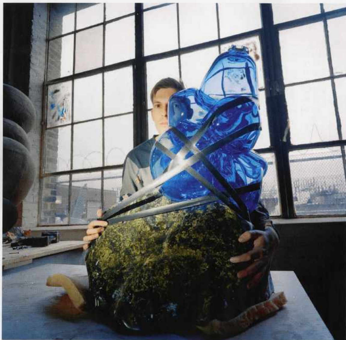
THE DESIGNER WITH REMEMBERING DREAMS, ACCESS TO ANCIENT WISDOM, 2020, IN GREENSTONE AND CLASS

right angles and have been described using such endearing adjectives as 'squishy' or 'slouchy', as if you were referring to a cartoon character or stuffed toy. As I walk through the studio I glimpse a bronze shelf, which was handcast on site. On its side, it looks like an abstract sculpture, but when stood up, shelves appear from its anthropomorphic figure. I, too, start to think of this structure as a lovable cartoon character.