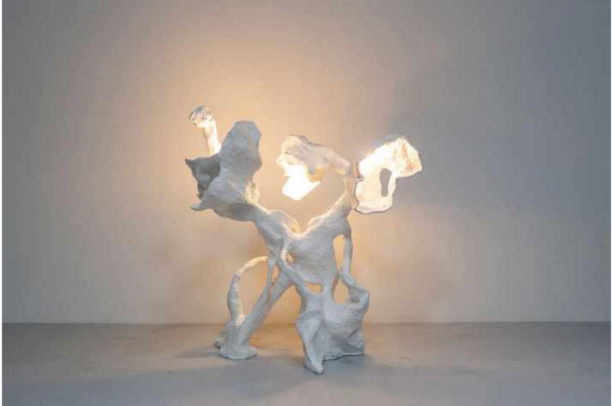
OrtaMiklos, 'Coral Ghost', 2021

The young designers came up together and began collaborating while studying at the celebrated Design Academy Eindhoven, graduating just before the pandemic. Their particular blend of unconstrained experimentation, embodied critique, and an enfant-terrible nature helped shape a facet of the contemporary collectible design landscape that is particularly prevalent today.