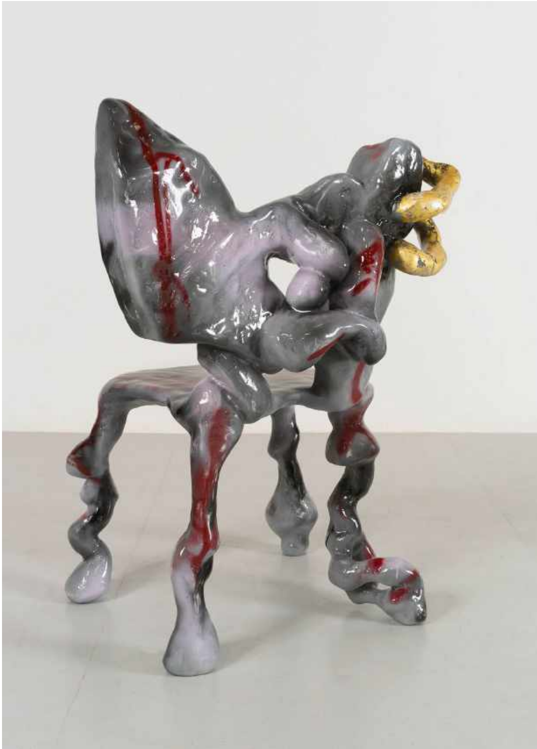
OrtaMiklos, 'Apocalypticopunk', 2021

partially conceal his identity during interviews. A meteoric end, marked by one last show, is entirely in keeping with the studio's theatrical character.