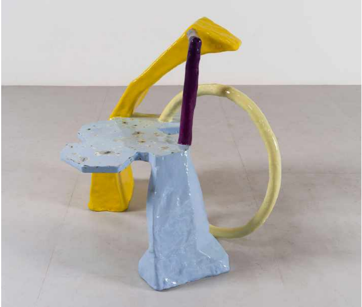
OrtaMiklos, 'Yellow Foot', 2021