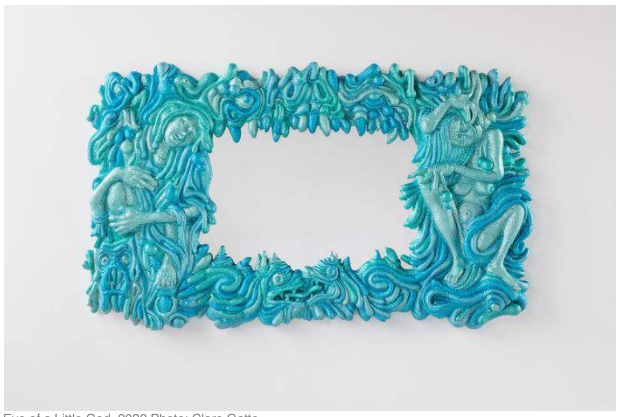
Eye of a Little God, 2022

"I called my grandparents more frequently during the pandemic, and we had some great conversations. They talked about growing up in the war and collecting scrap metal and how smallpox was still prevalent at the time. It was this invisible enemy that nobody understood but everyone felt susceptible to. I asked them what it was like, and they said it was scary and stressful, but they were also kids and were resilient. I started reading about previous plagues, specifically the Middle Ages, and the symbolism that emerged during that time. The figurative motif on the top of Mortal Bench is called 'death and the maiden' and there are countless examples of this in art history, starting in the Middle Ages. It's always a young woman, and then across from her is a manifestation of death. It means, 'Remember, you will always die.' It isn't pessimistic symbolism; it's realistic and hopeful. The point is, 'Remember to be grateful for the days that you have and make the most of them.' The oval seating arrangement relates to time. You might find a form like this in a train station or an old hotel lobby. It's more of a seat you would sit in while you wait for something. I liked the idea that it related to a sense of time."