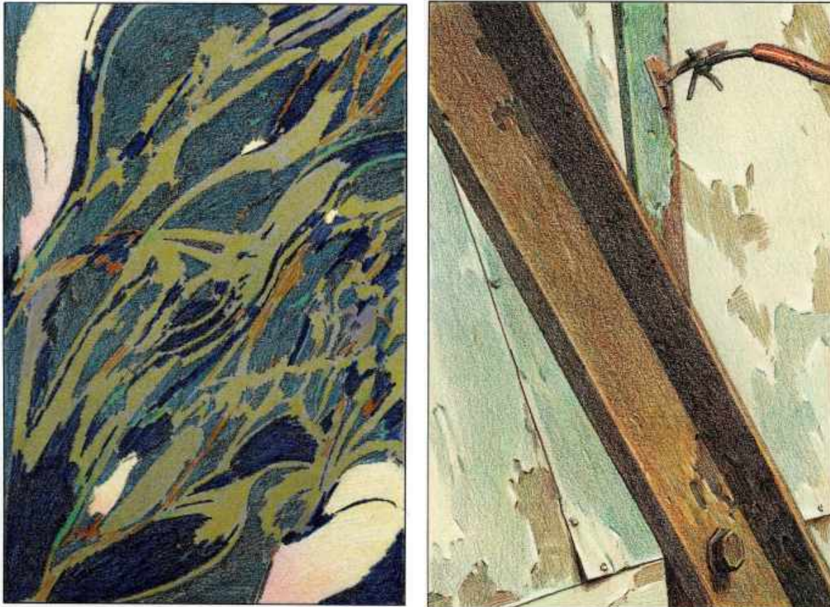
Solohouse (Courtesy Friedman Benda and Lebbeus Woods)

For Woods, architecture was always a means of orienting ourselves within unstable environmental conditions, from floods and war zones to earthquakes and interstellar space—a tool of survival for situating humanity in unusual, even hostile, spaces. In both the visions for Alien 3 and Woods’s arguably best-known work, Einstein Tomb (1980), this meant divorcing architecture from solid ground altogether, from the very idea of a planet. This approach was motivated not by an interest in science fiction for its own sake, but in trying to discover a space for ourselves founded literally on nothing—no home, no foundation, no land, just structure and refuge amidst pressure and immensity. That, for Woods, was architecture’s philosophical goal.