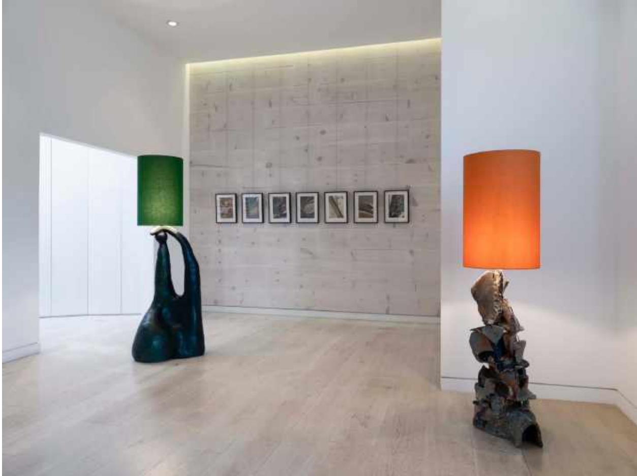
Julian Calero/Courtesy Friedman Benda and Lebbeus Woods

The purpose of that building—a meticulously designed postmodern folly perched atop a hill—recalls Sir Francis Bacon’s fictional Salomon’s House, a philosophical meeting hall proposed in Bacon’s 1627 book New Atlantis , where obscure scientific tools would be designed, assembled, and displayed. The carefully measured plans of the building itself suggest a mandala—a kind of Buddhist spiritual chart—complete with nested circles, a symmetrical layout, and implied cosmic symbolism. Are these esoteric religious diagrams or eerily beautiful construction documents?