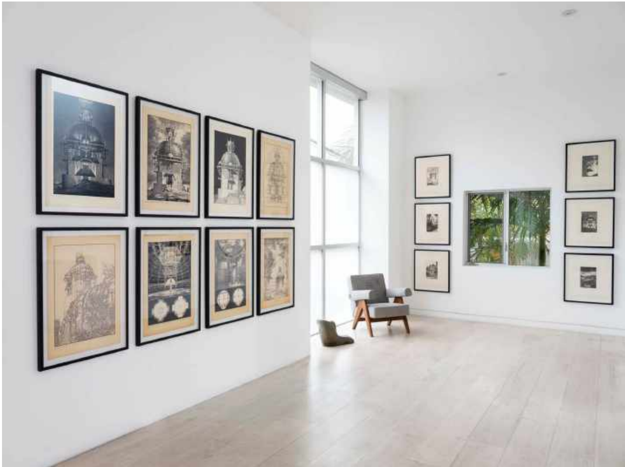
Calero/Courtesy Friedman Benda and Lebbeus Woods

Lebbeus Woods died at his home in New York City on October 30, 2012. It was the same night that remnants of Hurricane Sandy flooded the streets of Lower Manhattan—where Woods lived—with 80 mph tropical winds and a powerful Atlantic storm surge. Dry land transformed into seabed, a city of glass towers resembling a reef: This urban conversion would not have been out of place in Woods’s own work. A prolific artist, writer, teacher, and architect, Woods left behind a voluminous personal archive of drawings, models, and essays, all of which reframed architecture not as an aesthetic pursuit, but as a radical act of philosophical, literary, and scientific, even cosmic, speculation.