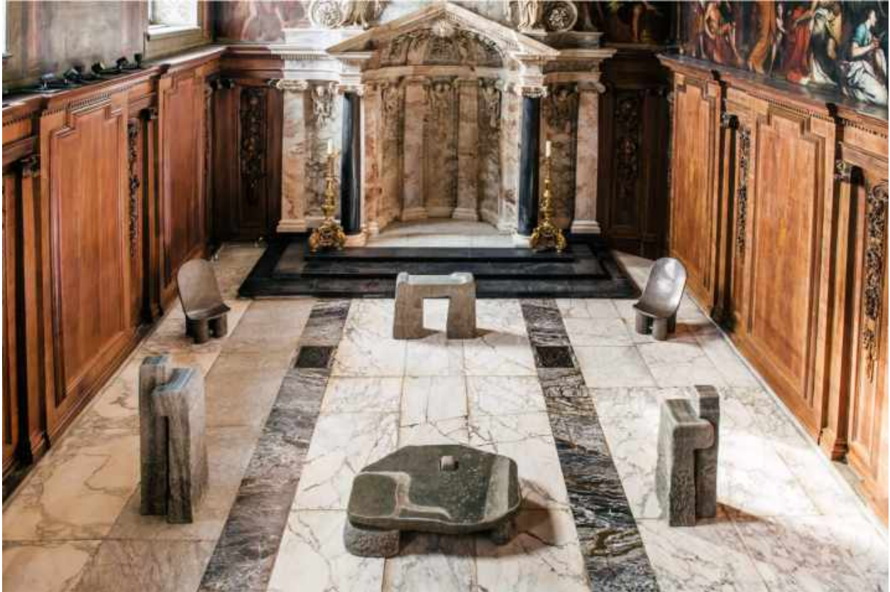
Faye Toogood's works in marble in the Chapel.

Among the exhibition's most impressive pieces is Faye Toogood's body of work created for the occasion. Part of 'Assemblages', her ongoing exploration of domestic shapes that can be both abstract and functional, the pieces are made of Bog Oak and Purbeck Marble, and shown respectively within the house's Oak Room and Chapel. The stone objects are reminiscent of Neolithic forms, featuring a mix of rough and polished edges: placed in the Chapel as sacred objects and complemented by the designer's bronze seating, inviting visitors to pause for a moment of contemplation, they reference a local history of stone circles in the area.