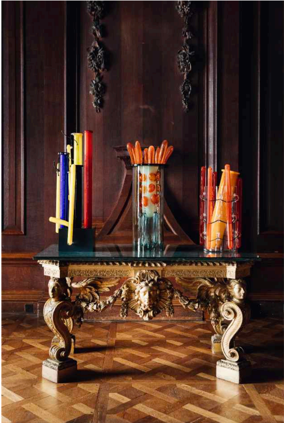
Ettore Sottsass.

Rosa Bertoli, "Chatsworth House design exhibition explores contemporary design themes in an eclectic setting," Wallpaper* , March 16, 2023.