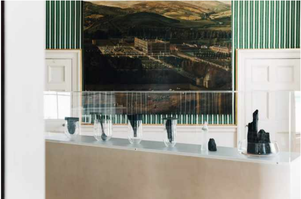
Formafantasma.