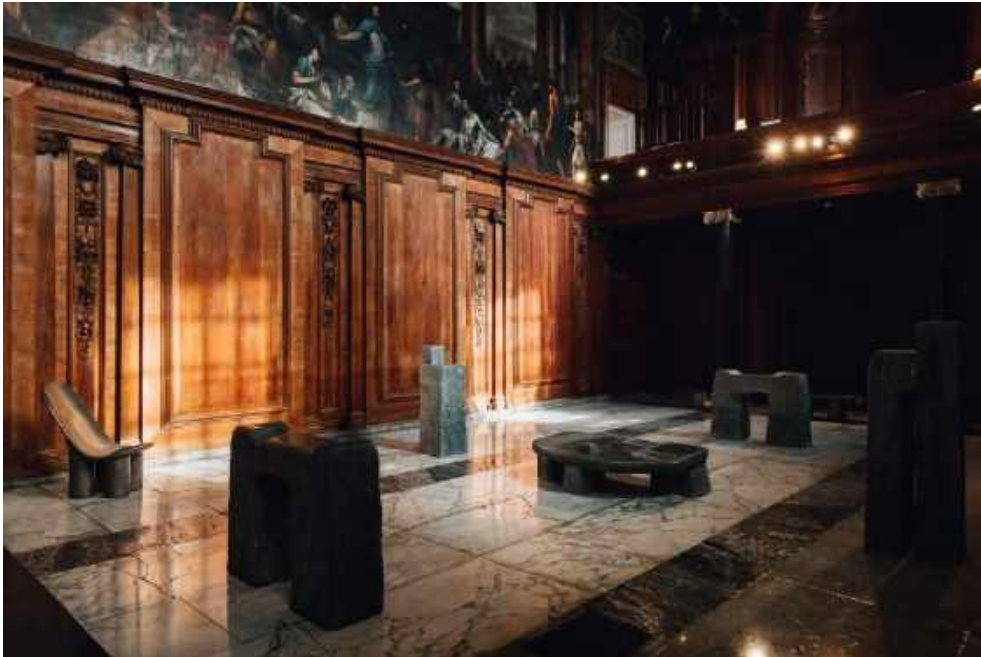
Toogood's monolithic furniture creates a pensive space within the exhibition

"It can capture their imaginations and hopefully inspire them to explore Chatsworth in a different light."