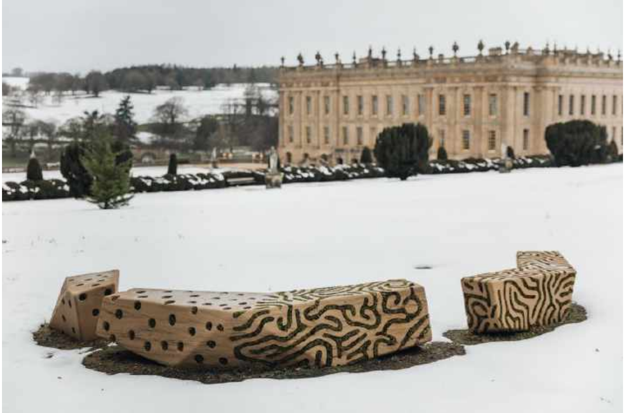
Dutch designer Joris Laarman designed a series of benches for the exhibition

Two stone benches by Dutch designer Joris Laarman made from locally sourced gritstone, which was the material used to build the house itself, were placed in Chatsworth House's gardens.