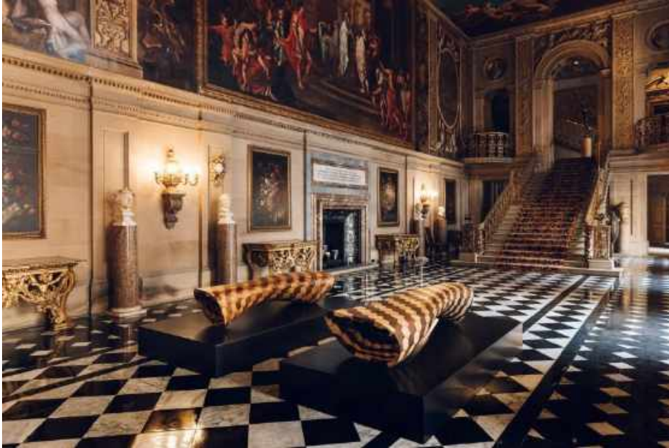
The exhibition introduces new art pieces and objects into the house and garden

Some responded by sourcing materials from the property itself, while others focussed on themes and ideas taken from decorations within the interiors.