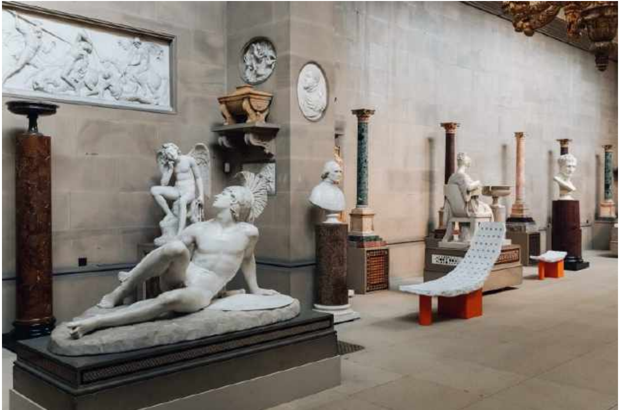
Chatsworth's collection contains art and design pieces spanning 4,000 years

Ross's pieces were designed to echo the surrounding sculptures, mimicking their form to invite viewers to imagine the body that would recline on them. The designer has used a material palette of stone and marble to further reflect the sculptures within the gallery.