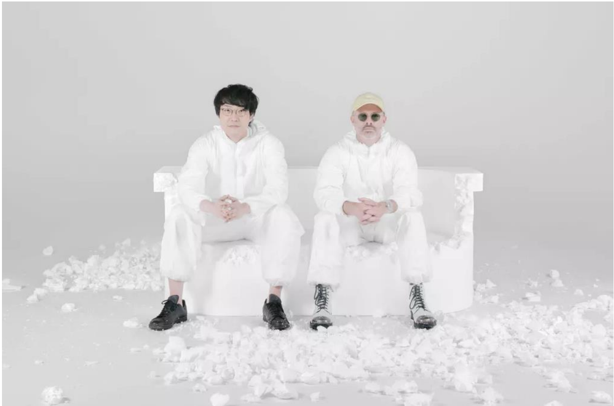
Nendo's Oki Sato and Daniel Arsham

An artist who creates by breaking, and a designer who creates things to be broken: American artist Daniel Arsham and Oki Sato of Japanese design firm Nendo have engaged in a dialogue spanning over four years, culminating in their latest collaboration titled 'Break to Make', debuting at Milan Design Week 2023.